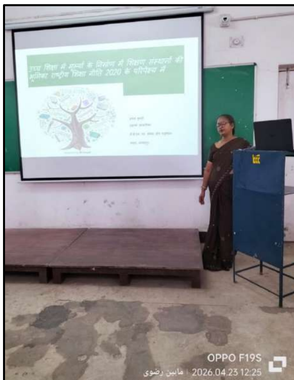
PIC 1 & 2: FACULTY PRESENTING RESEARCH PAPER AT KARIM CITY COLLEGE