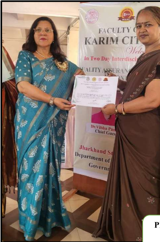
PIC 3 & 4: FACULTY RECEIVING THEIR CERTIFICATE AFTER PAPER PRESENTATION

(Recognised by National Council for Teacher Education) Affiliated to Kolhan University, Chaibasa & J. A. C., Ranchi, Jharkhand Road No. 23, Farm Area, Kadma, Jamshedpur-831005 | Phone : 2309097 E-mail : dbms.edu23@gmail.com | Website : dbmscollege.in