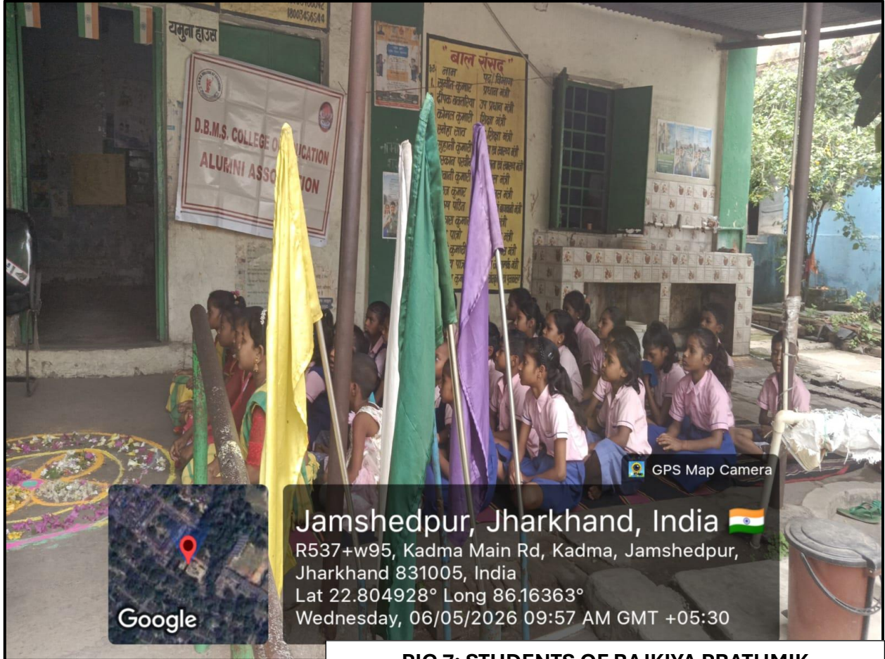
PIC 7: STUDENTS OF RAJKIYA PRATHMIK VIDYALAYA, GOLPAHARI, EXCITED AND GRATEFUL DURING THE वर्ण-सेतु DISTRIBUTION DRIVE