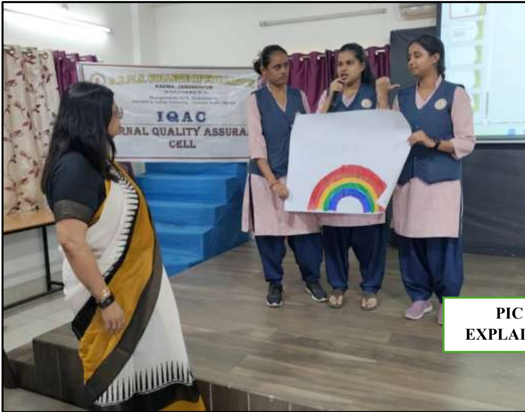
PIC 3: STUDENTS EXPLAINING THEIR ART

E-mail : dbms.edu23@gmail.com | Website : dbmscollege.in