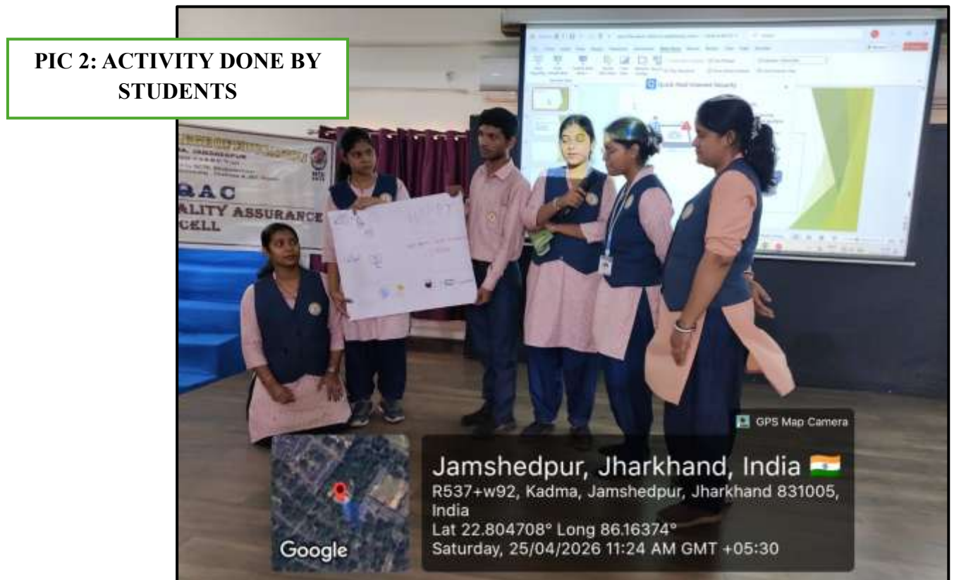
PIC 2: ACTIVITY DONE BY STUDENTS