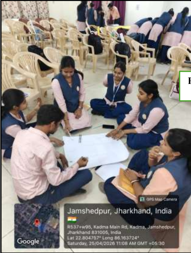
PIC 1: GROUP ASSIGNMENT BY THE STUDENTS