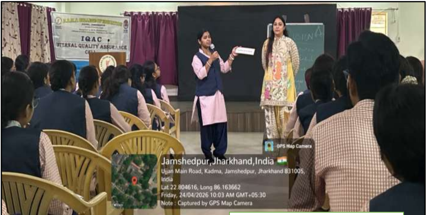
PIC 4: STUDENT ANSWERING QUESTIONS.