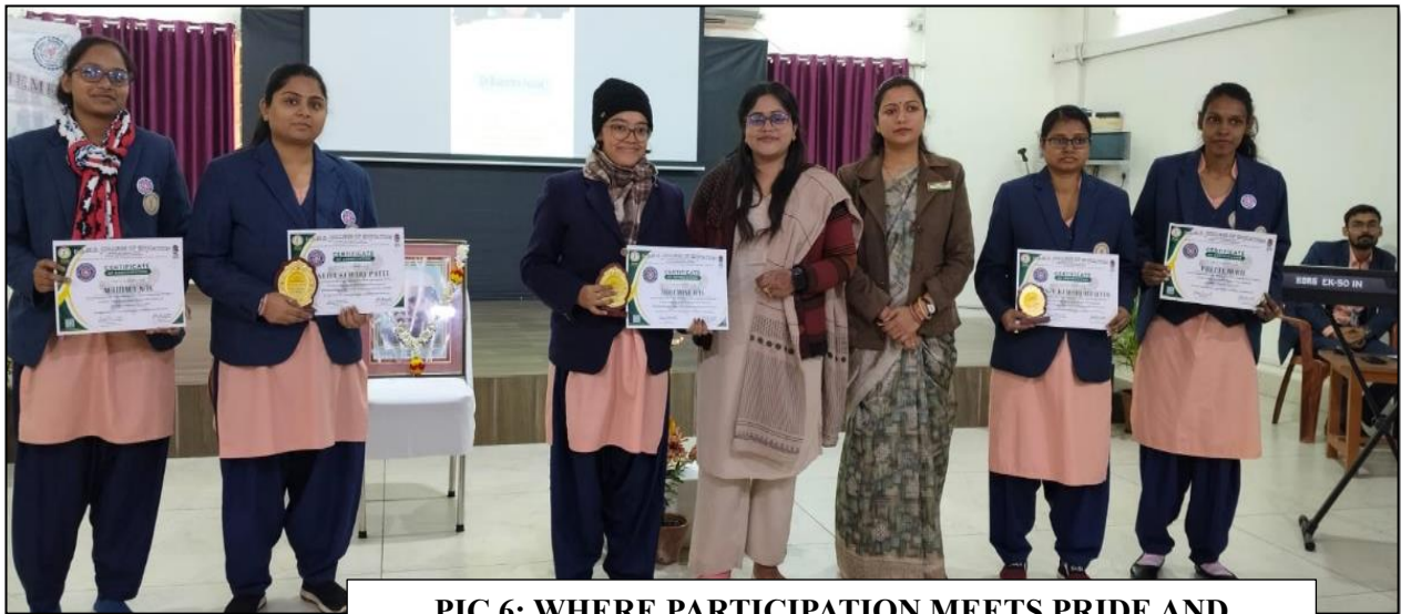
PIC 6: WHERE PARTICIPATION MEETS PRIDE AND WINNERS SHINE BRIGHT