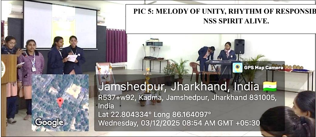
PIC 5: MELODY OF UNITY, RHYTHM OF RESPONSIBILITY- NSS SPIRIT ALIVE.

(Recognised by National Council for Teacher Education) Affiliated to Kolhan University, Chaibasa & J. A. C., Ranchi, Jharkhand Road No. 23, Farm Area, Kadma, Jamshedpur-831005 | Phone : 2309097 E-mail : dbms.edu23@gmail.com | Website : dbmscollege.in