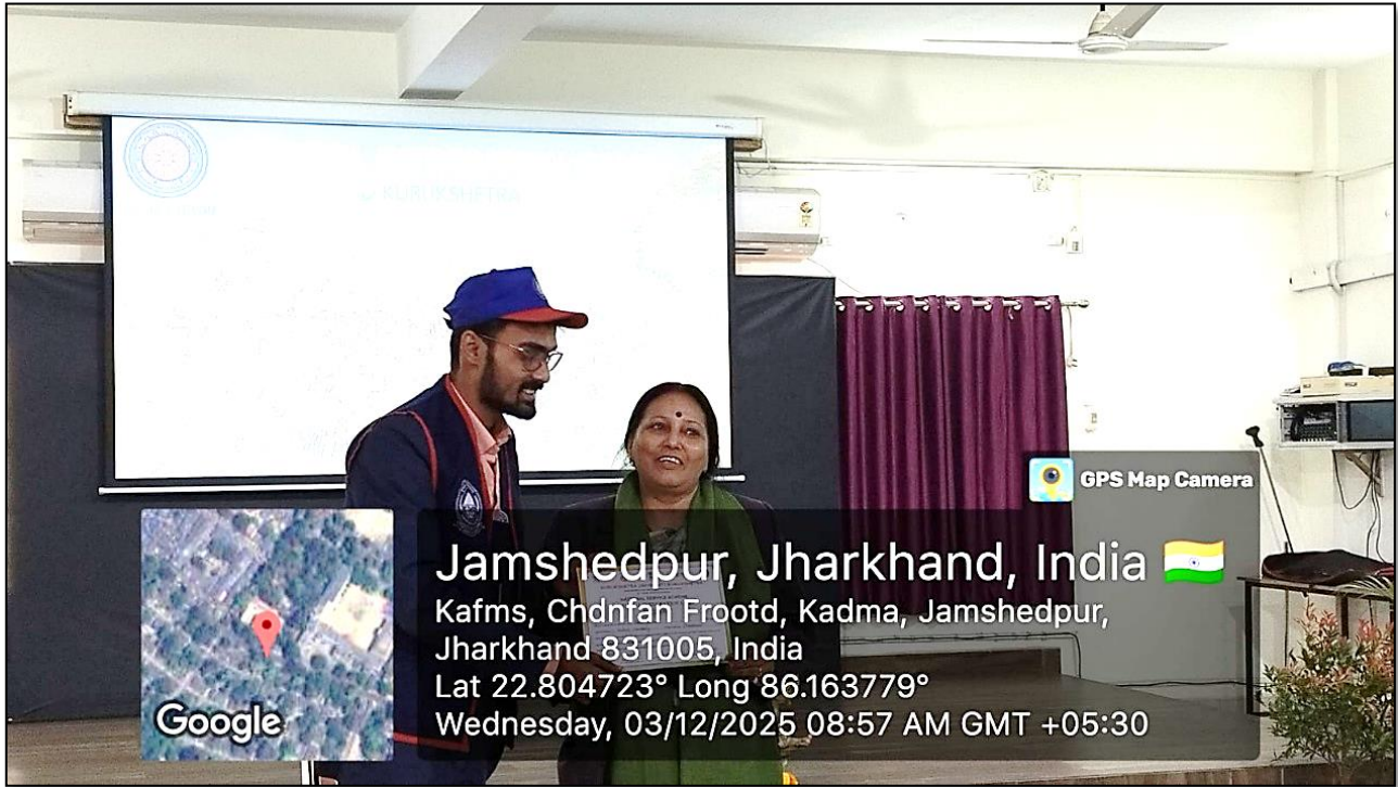
PIC 7: UNITY, DISCIPLINE AND LEARNING – SHARED WITH HEARTFELT SINCERITY

(Recognised by National Council for Teacher Education) Affiliated to Kolhan University, Chaibasa & J. A. C., Ranchi, Jharkhand Road No. 23, Farm Area, Kadma, Jamshedpur-831005 | Phone : 2309097 E-mail : dbms.edu23@gmail.com | Website : dbmscollege.in