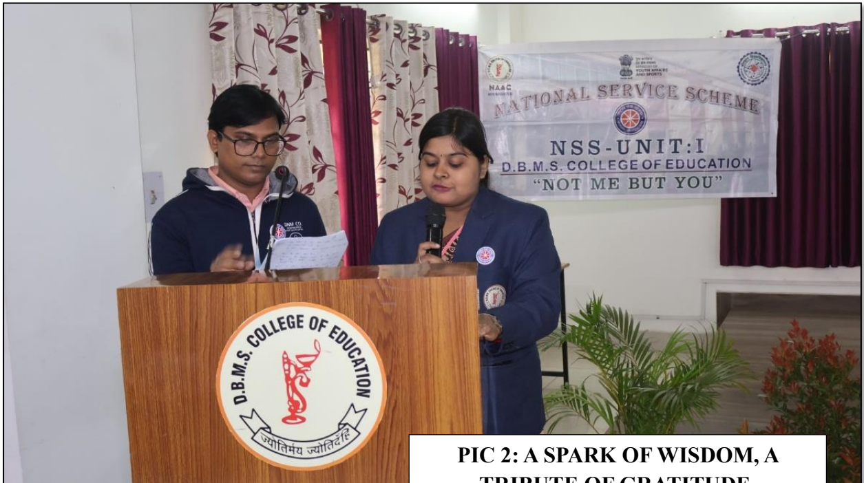
PIC 2: A SPARK OF WISDOM, A TRIBUTE OF GRATITUDE.