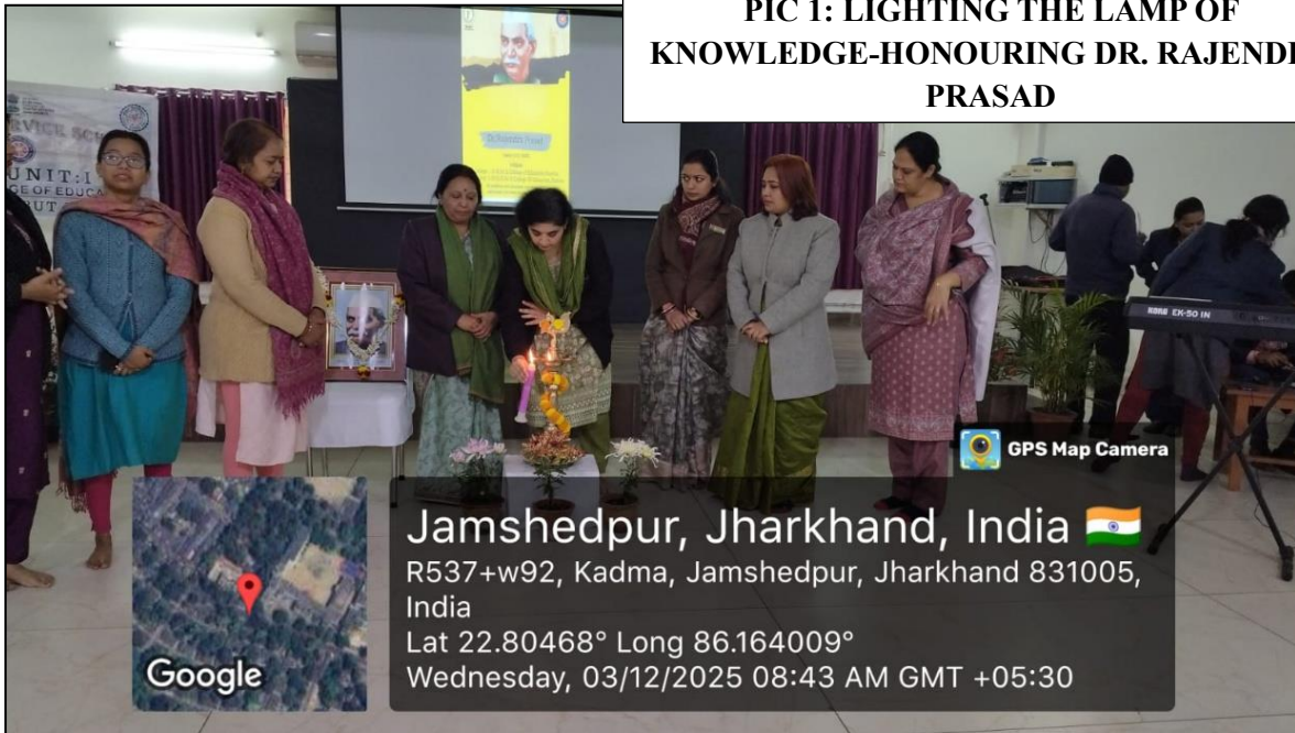
PIC 1: LIGHTING THE LAMP OF KNOWLEDGE-HONOURING DR. RAJENDRA PRASAD