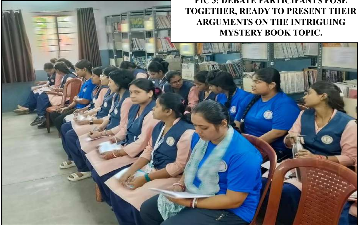
PIC 3: DEBATE PARTICIPANTS POSE TOGETHER, READY TO PRESENT THEIR ARGUMENTS ON THE INTRIGUING MYSTERY BOOK TOPIC.

E-mail : dbms.edu23@gmail.com | Website : dbmscollege.in