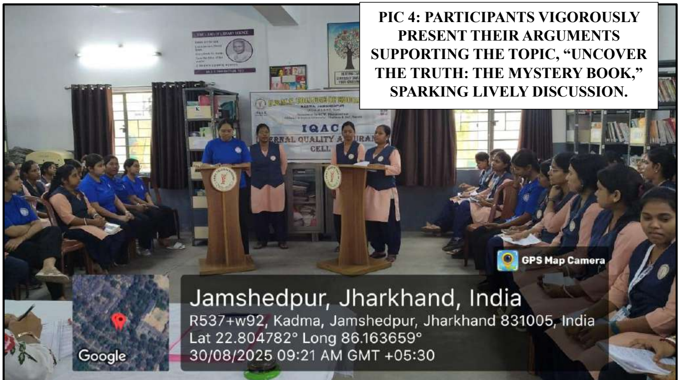
PIC 4: PARTICIPANTS VIGOROUSLY PRESENT THEIR ARGUMENTS SUPPORTING THE TOPIC, "UNCOVER THE TRUTH: THE MYSTERY BOOK," SPARKING LIVELY DISCUSSION.