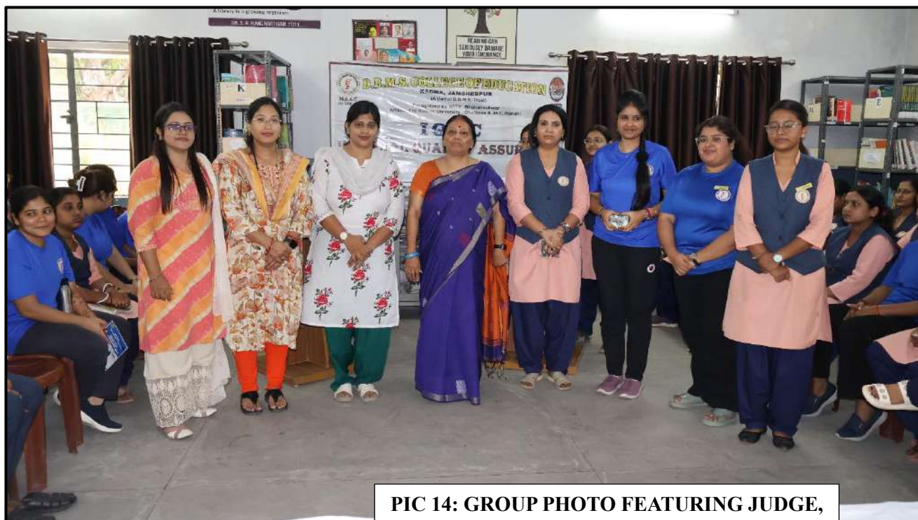
PIC 14: GROUP PHOTO FEATURING JUDGE, BEST SPEAKERS, THE STUDENT COUNCIL, AND THE ORGANISING TEAM, MARKING THE MEMORABLE CONCLUSION OF AN INSPIRING DEBATE.