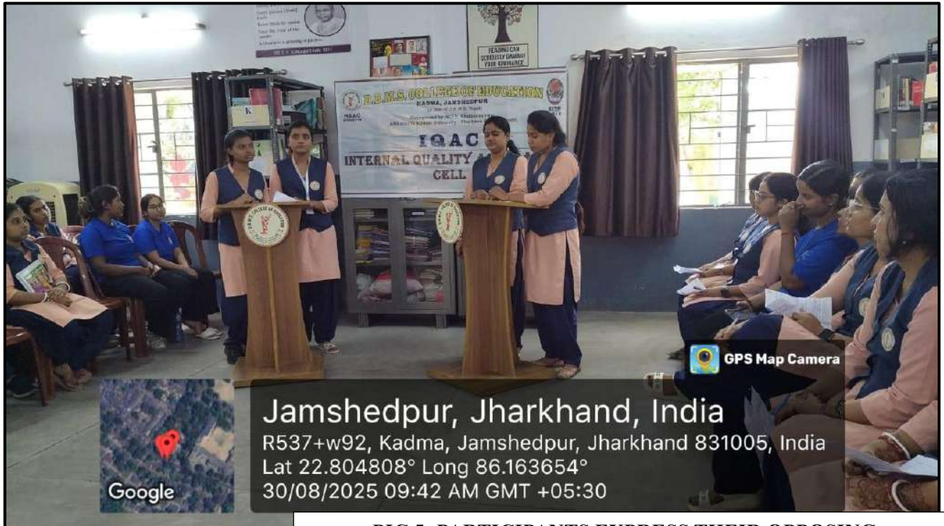
PIC 5: PARTICIPANTS EXPRESS THEIR OPPOSING VIEWPOINTS, CHALLENGING PERSPECTIVES AND ENCOURAGING CRITICAL THINKING ON THE THEME.

E-mail : dbms.edu23@gmail.com | Website : dbmscollege.in