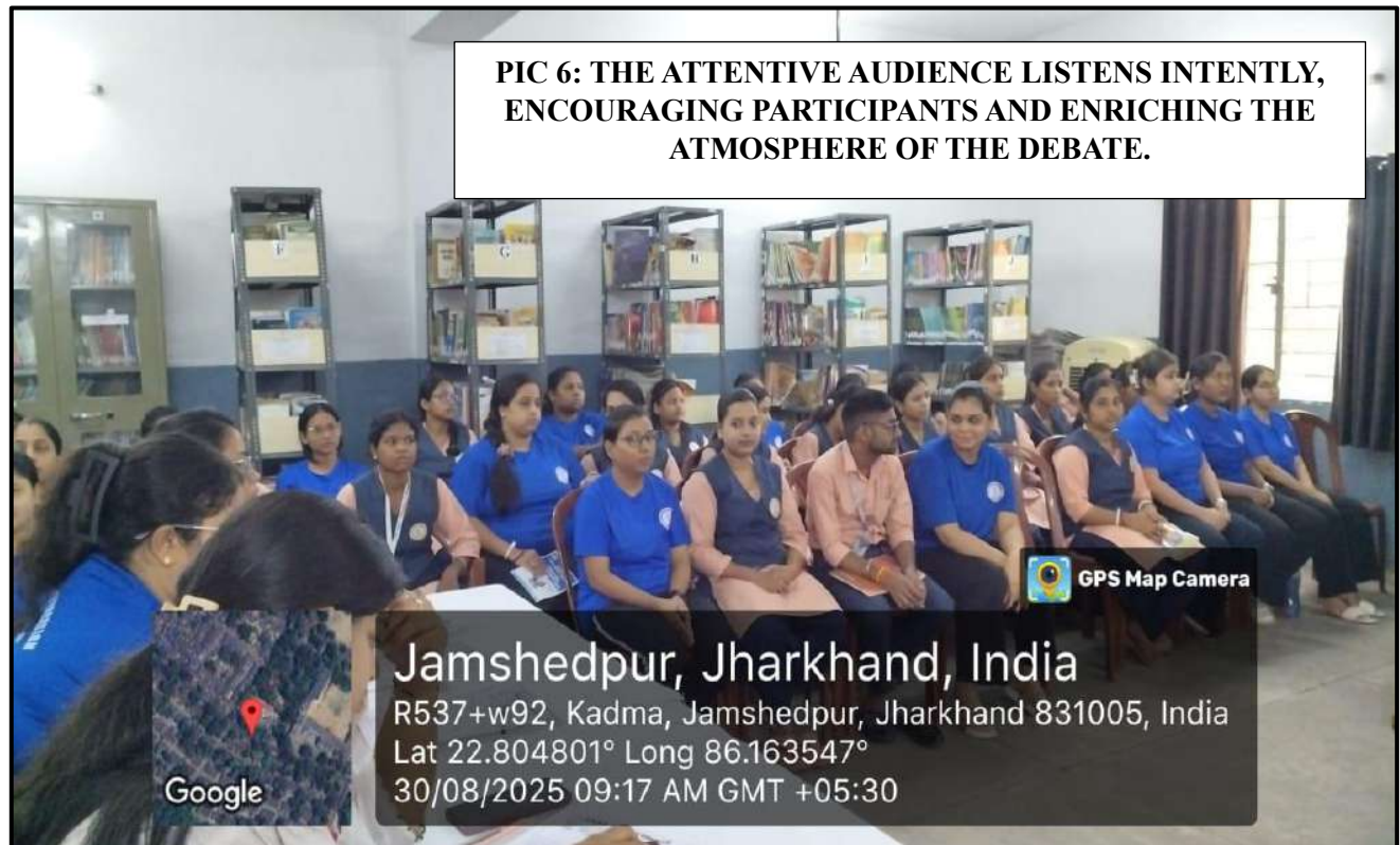
PIC 6: THE ATTENTIVE AUDIENCE LISTENS INTENTLY, ENCOURAGING PARTICIPANTS AND ENRICHING THE ATMOSPHERE OF THE DEBATE.