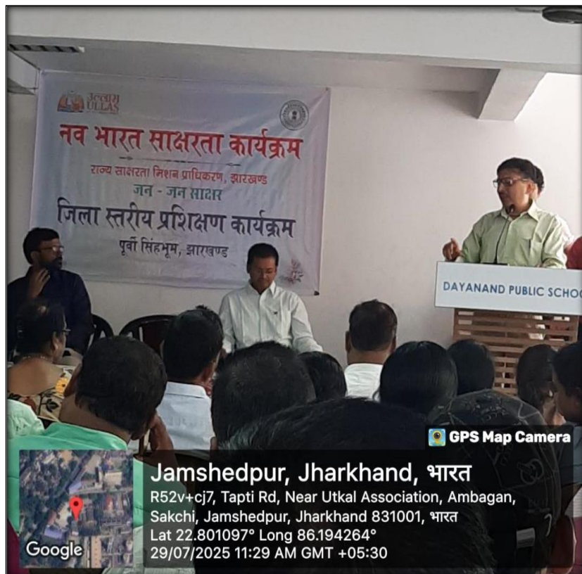
PIC 1-EMPOWERING COMMUNITIES THROUGH LITERACY-ULLAS IGNITES THE