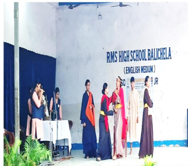
PIC: 01 PERFORMANCE BY FIRST SEMESTER B.ED. STUDENTS ON PLAY JULIUS CAESAR