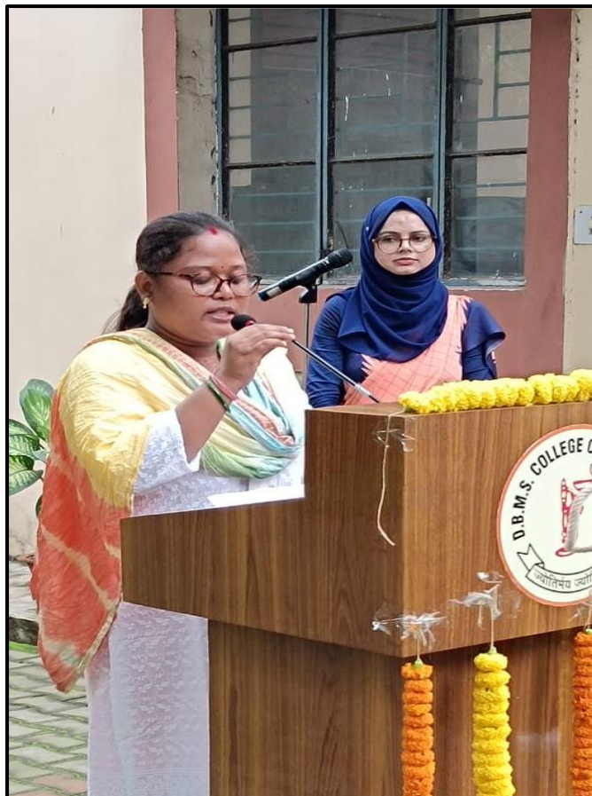
PIC 5- HO POEM BY KUNIKA SINGH KUNTIYA