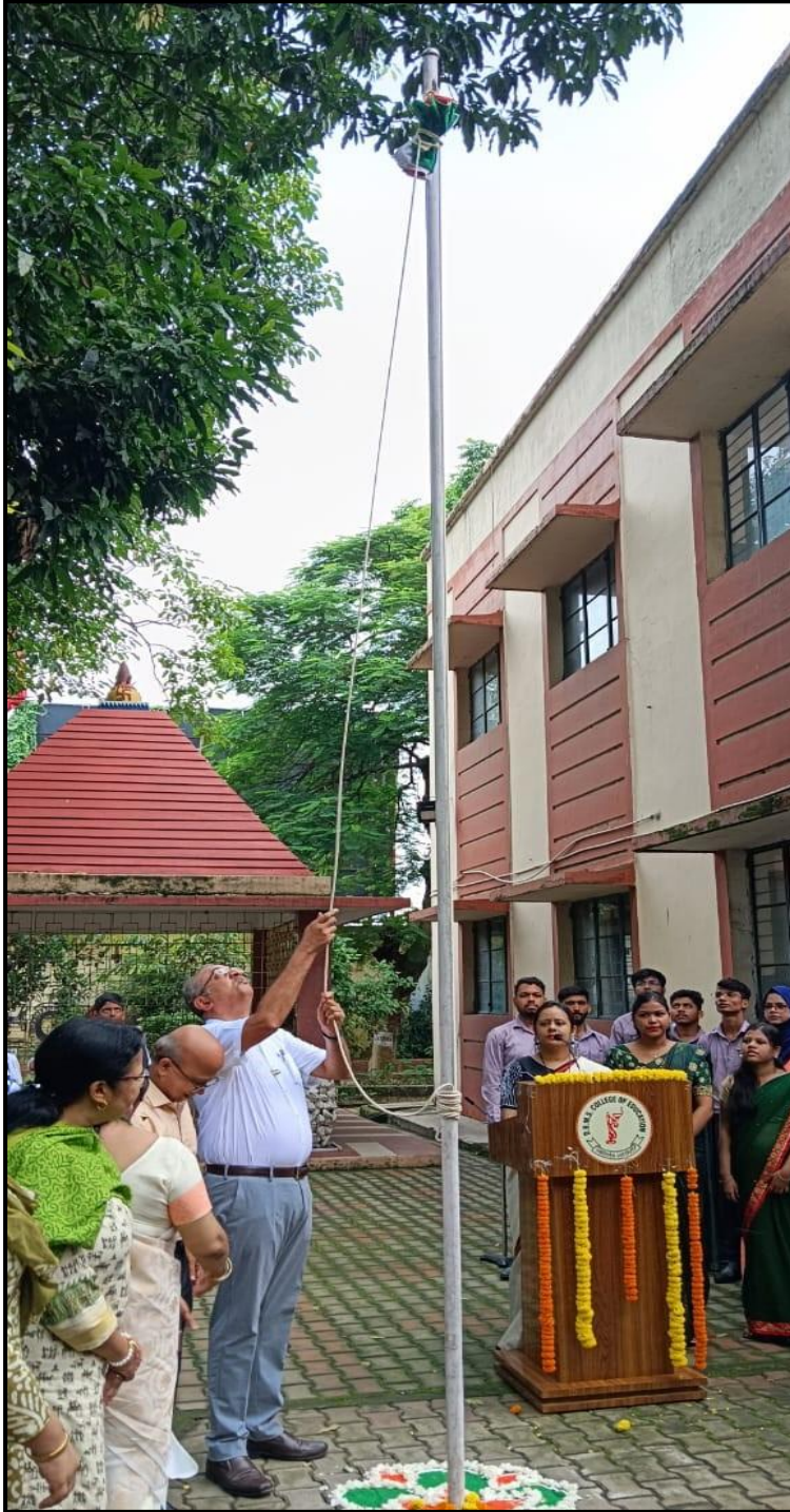
PIC 1: FLAG HOISTED BY OUR CHIEF GUEST