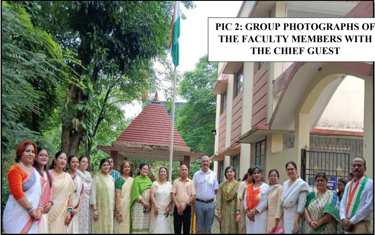
PIC 2: GROUP PHOTOGRAPHS OF THE FACULTY MEMBERS WITH THE CHIEF GUEST

E-mail : dbms.edu23@gmail.com | Website : dbmscollege.in