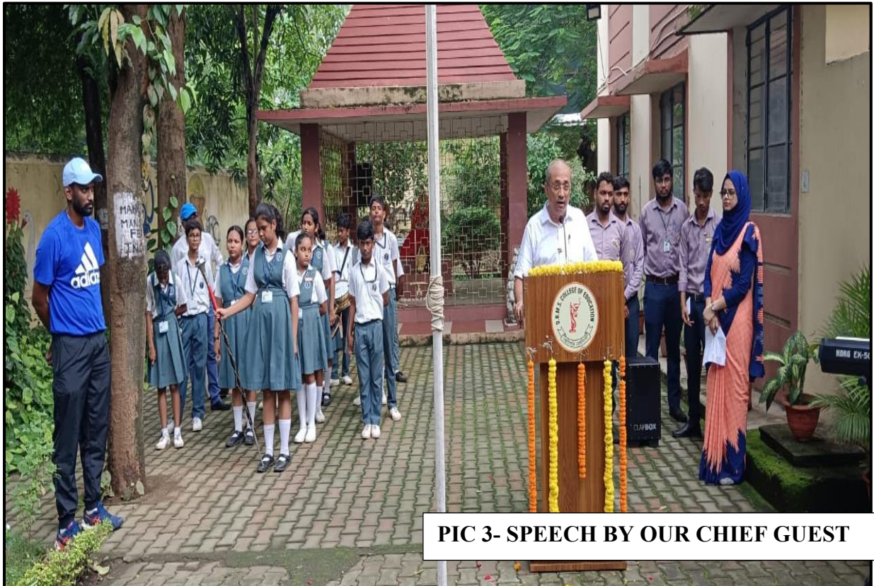
PIC 3- SPEECH BY OUR CHIEF GUEST