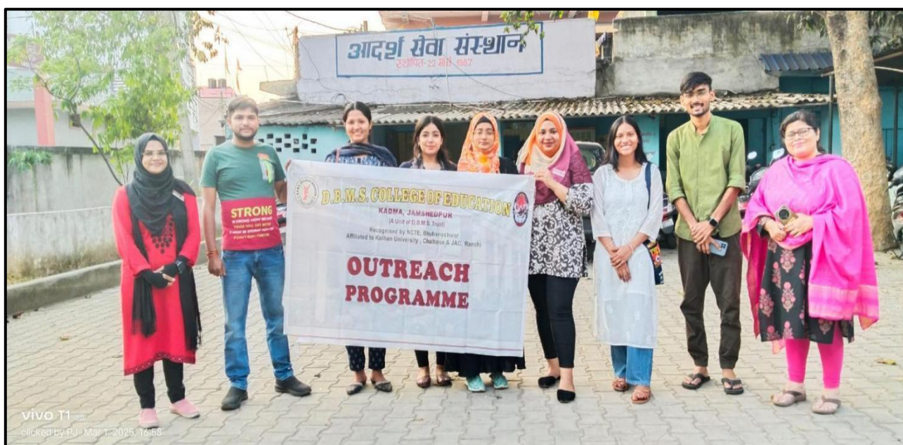
PIC 4 - STUDENTS, ALONG WITH THEIR TEACHER, IN THE PALNA GHAR, RUN BY ADARSH SEVA SANSTHAN.