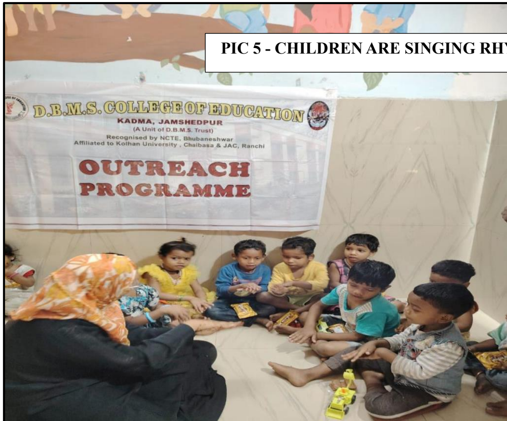
PIC 5 - CHILDREN ARE SINGING RHYMES

E-mail : dbms.edu23@gmail.com | Website : dbmscollege.in