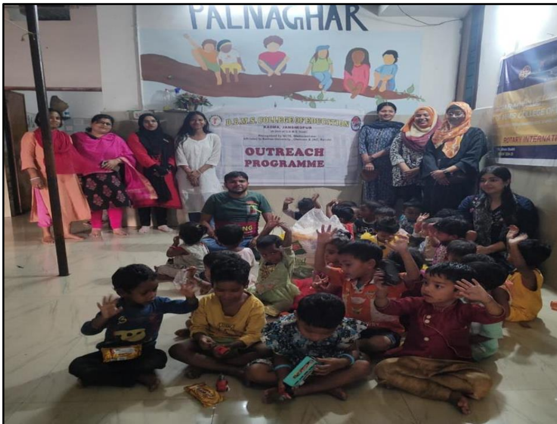
PIC 3 – CHILDREN ARE DOING AN ACTIVITY

E-mail : dbms.edu23@gmail.com | Website : dbmscollege.in