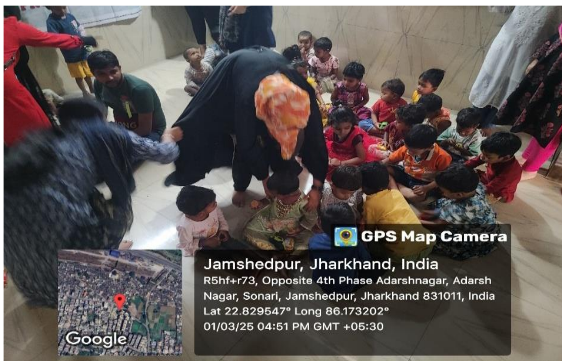
PIC 2 - STUDENTS ARE SHARING CHOCOLATES AND TOYS WITH THE KIDS