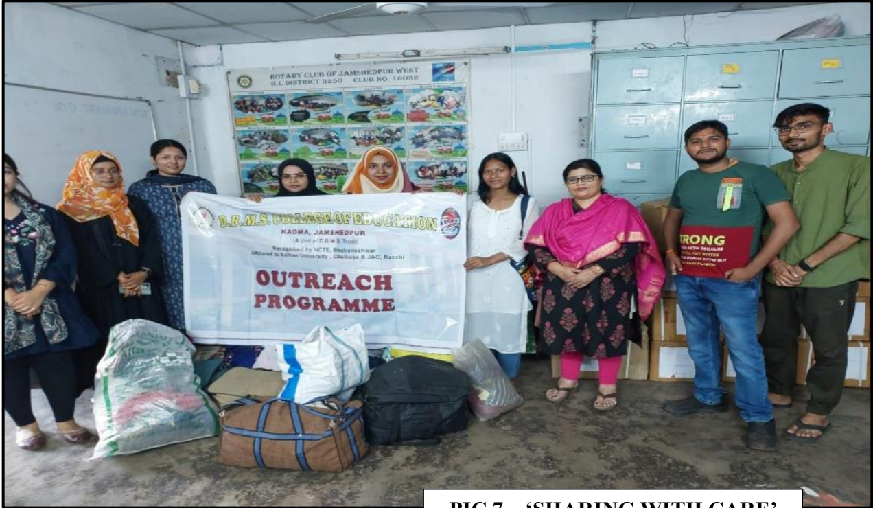
PIC 7 – 'SHARING WITH CARE'

E-mail : dbms.edu23@gmail.com | Website : dbmscollege.in