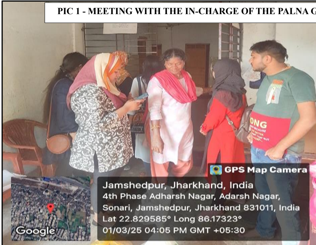
PIC 1 - MEETING WITH THE IN-CHARGE OF THE PALNA GHAR