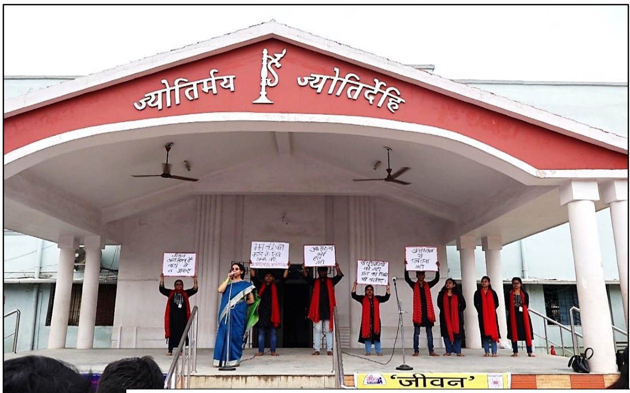
PIC 07: STUDENTS OF D.B.M.S. COLLEGE OF EDUCATION PERFORMING NUKKAD AND THE PRINCIPAL OF D.B.M.S. KADMA HIGH SCHOOL ADDRESSING THE STUDENTS