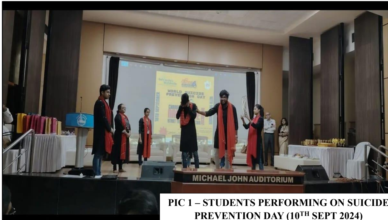
PIC 1 – STUDENTS PERFORMING ON SUICIDE PREVENTION DAY (10 TH SEPT 2024)