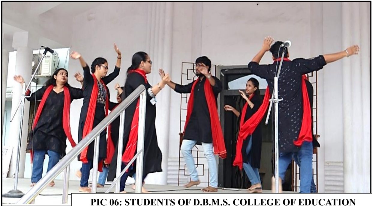
PIC 06: STUDENTS OF D.B.M.S. COLLEGE OF EDUCATION PERFORMING NUKKAD

E-mail : dbms.edu23@gmail.com | Website : dbmscollege.in