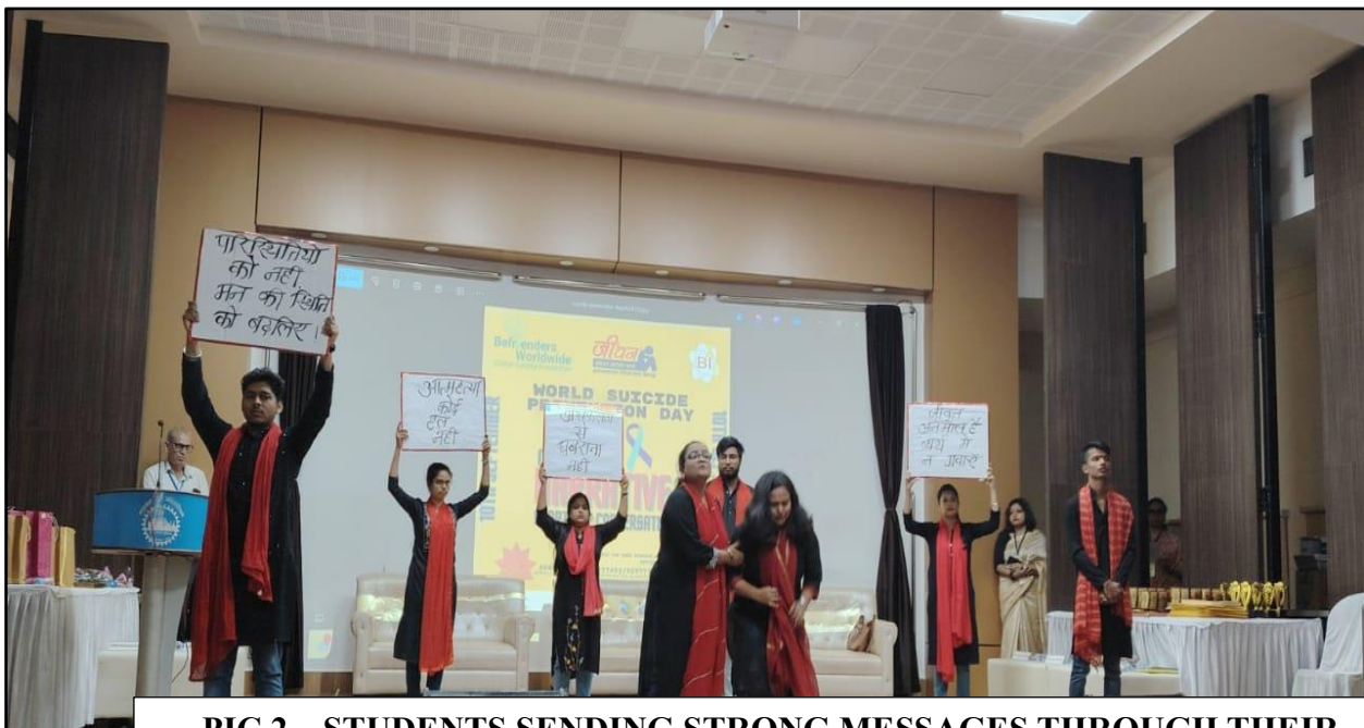
PIC 2 – STUDENTS SENDING STRONG MESSAGES THROUGH THEIR PERFORMANCE