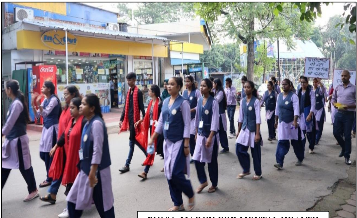
PIC 04: MARCH FOR MENTAL HEALTH AND SUICIDE PREVENTION