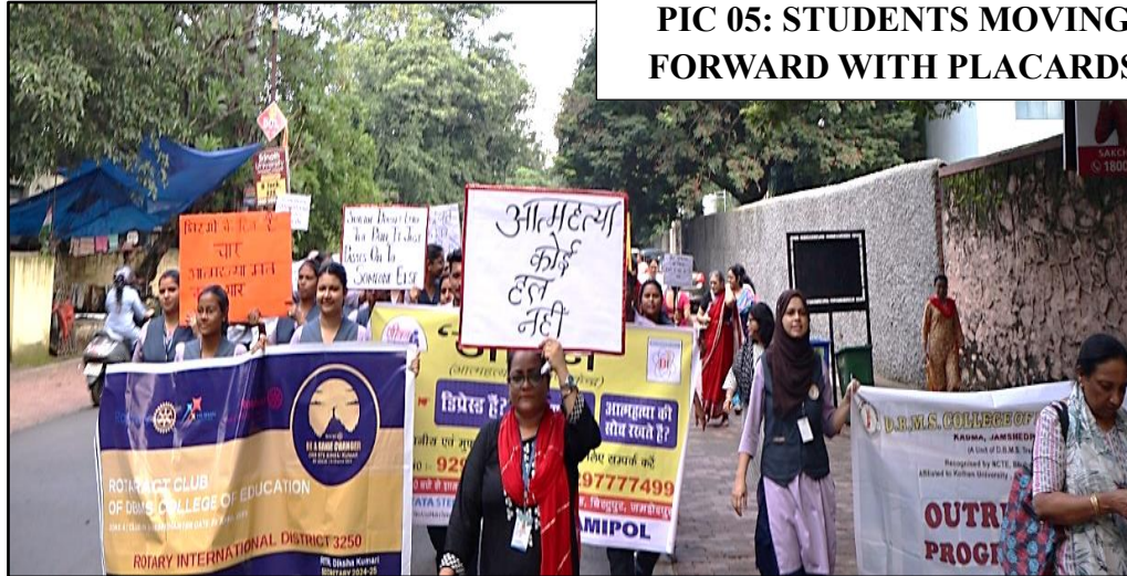
PIC 05: STUDENTS MOVING FORWARD WITH PLACARDS

E-mail : dbms.edu23@gmail.com | Website : dbmscollege.in