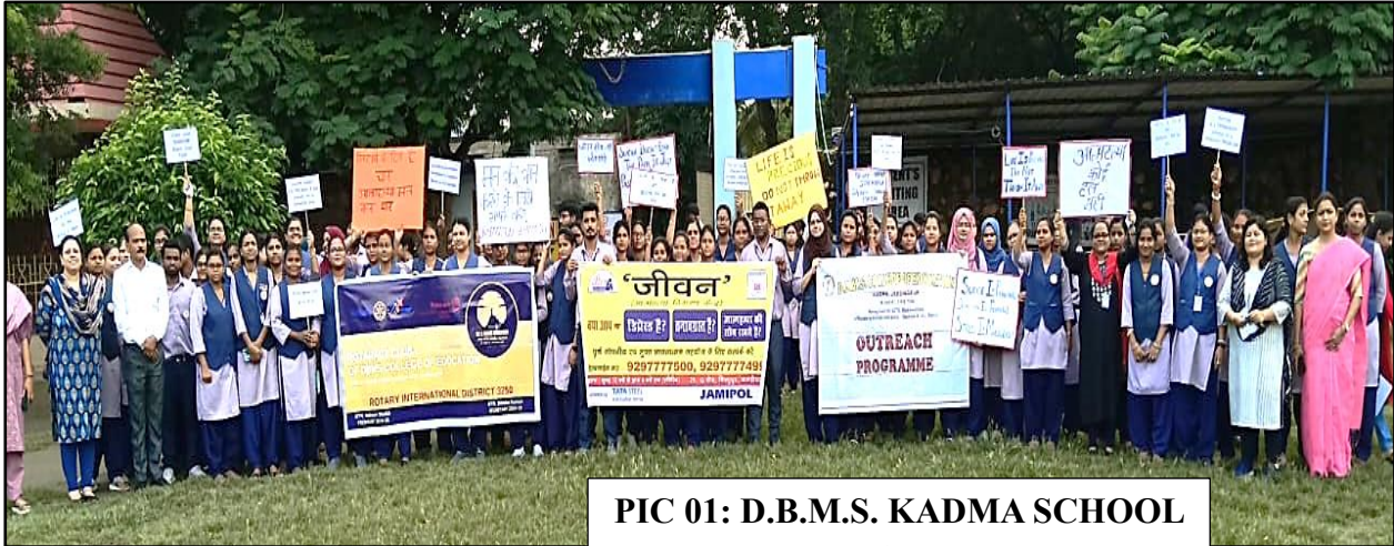
PIC 01: D.B.M.S. KADMA SCHOOL GROUND