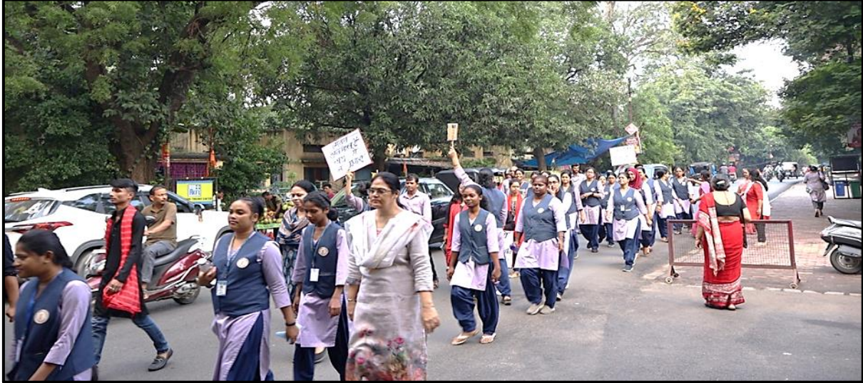
PIC 03: ENTHUSIASTIC STUDENTS MARCHING IN THE RALLY

E-mail : dbms.edu23@gmail.com | Website : dbmscollege.in