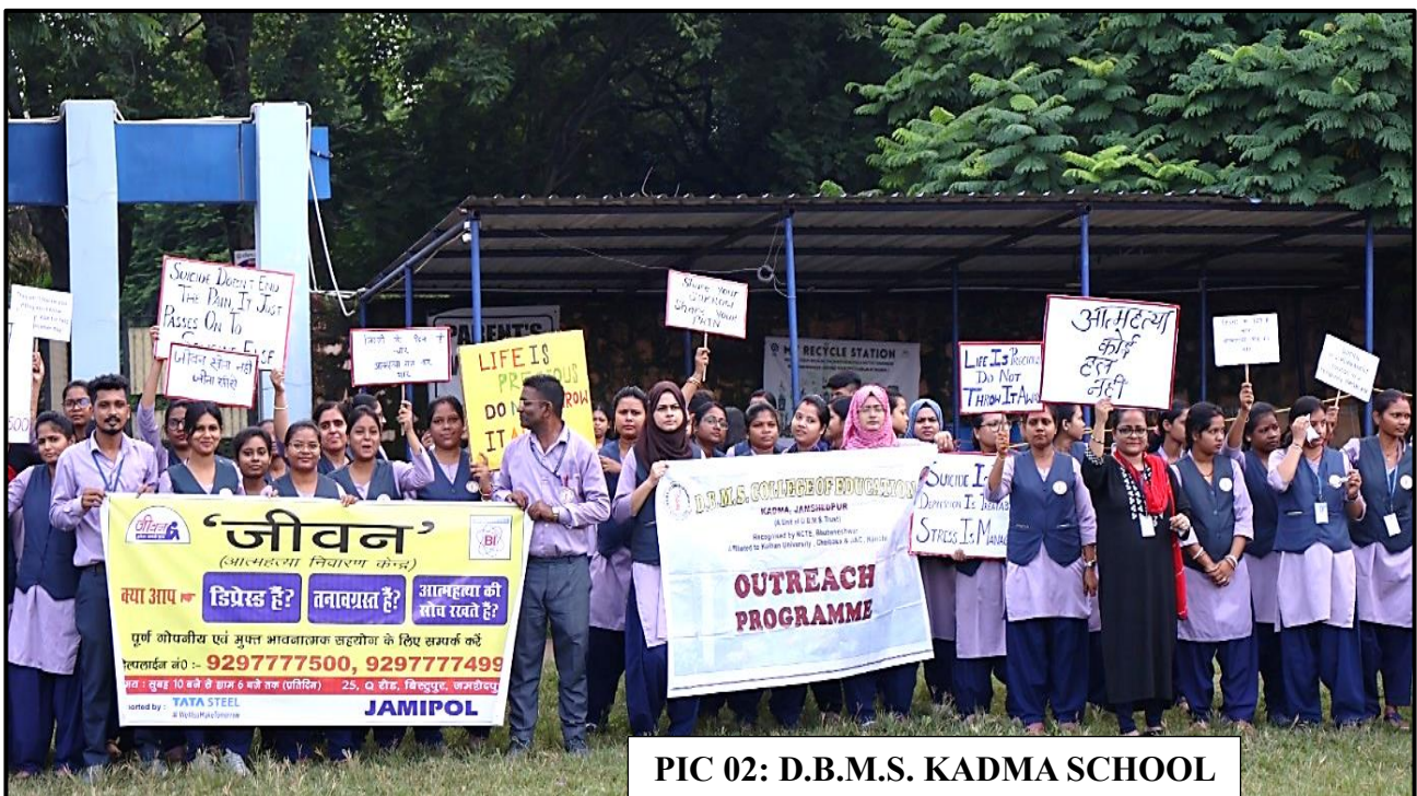
PIC 02: D.B.M.S. KADMA SCHOOL GROUND