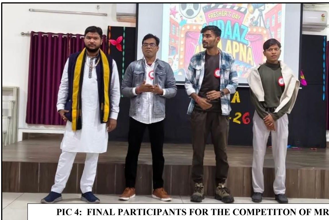
PIC 4: FINAL PARTICIPANTS FOR THE COMPETITION OF MR. FRESHERS