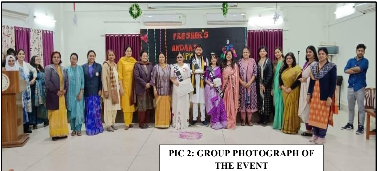
PIC 2: GROUP PHOTOGRAPH OF THE EVENT