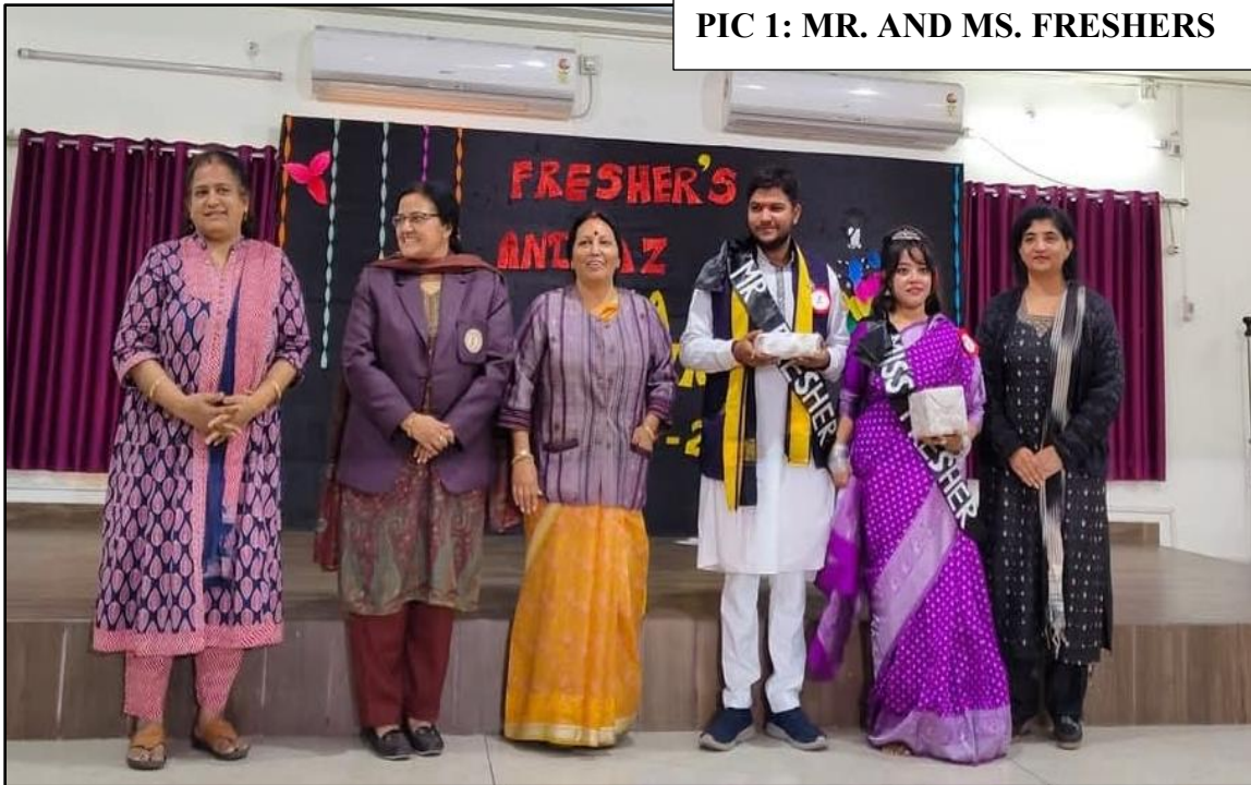
PIC 1: MR. AND MS. FRESHERS