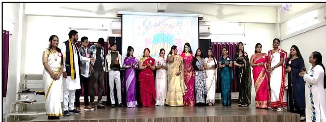
PIC 3: FINAL PARTICIPANTS FOR THE COMPETITION OF MR. AND MISS. FRESHERS

E-mail : dbms.edu23@gmail.com | Website : dbmscollege.in