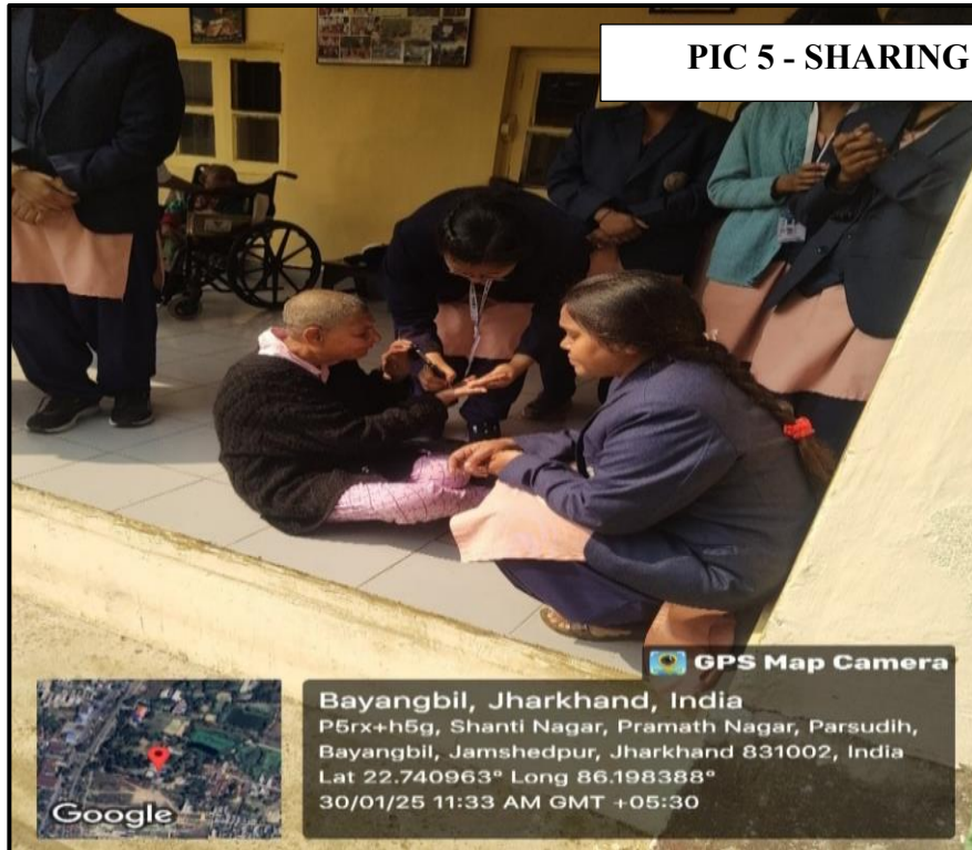
PIC 5 - SHARING FEELINGS

E-mail : dbms.edu23@gmail.com | Website : dbmscollege.in