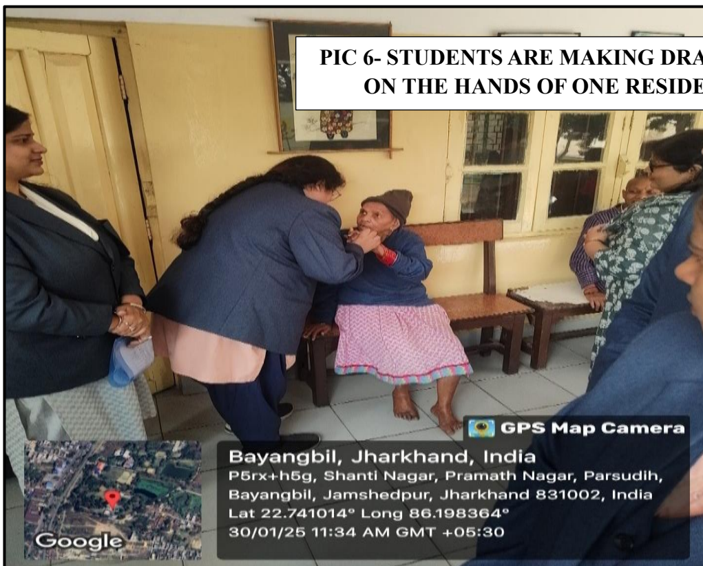
PIC 6- STUDENTS ARE MAKING DRAWINGS ON THE HANDS OF ONE RESIDENT

GPS Map Camera Bayangbil, Jharkhand, India P5rx+h5g, Shanti Nagar, Pramath Nagar, Parsudih, Bayangbil, Jamshedpur, Jharkhand 831002, India Lat 22.740963° Long 86.198388° 30/01/25 11:33 AM GMT +05:30