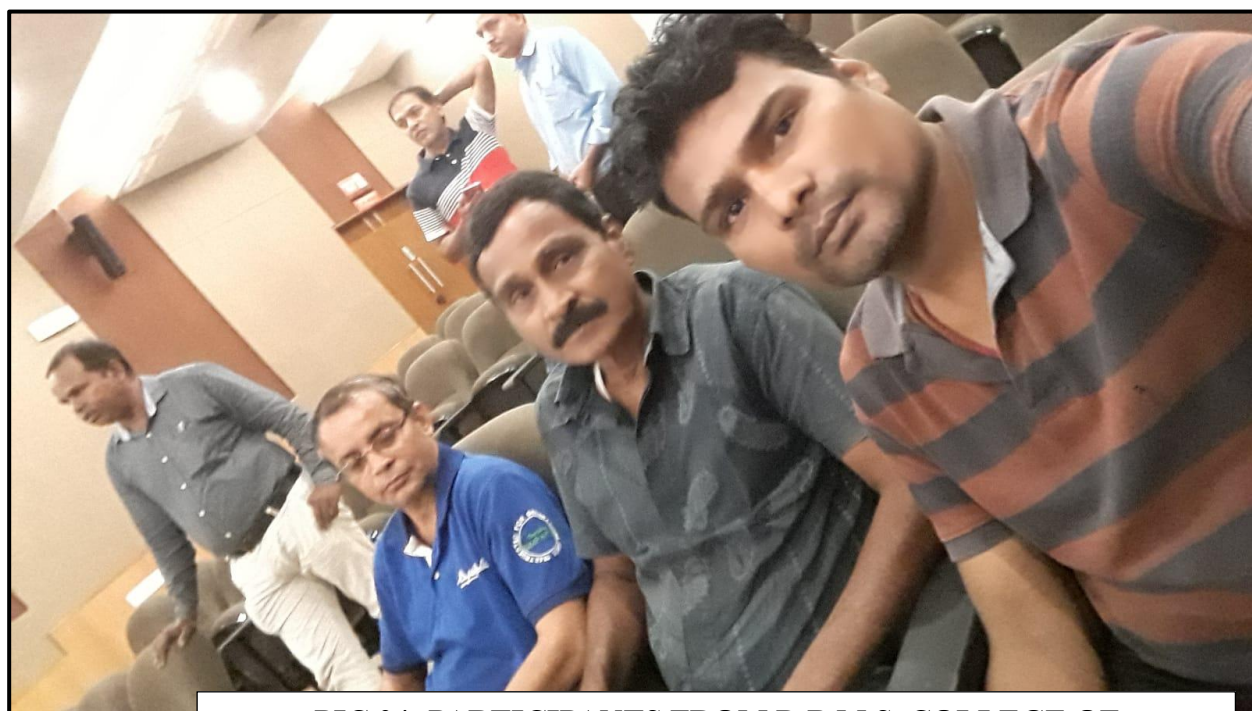
PIC 04: PARTICIPANTS FROM D.B.M.S. COLLEGE OF EDUCATION ENGAGE IN THE GENERAL GARDENING WORKSHOP ORGANIZED BY THE HORTICULTURAL SOCIETY