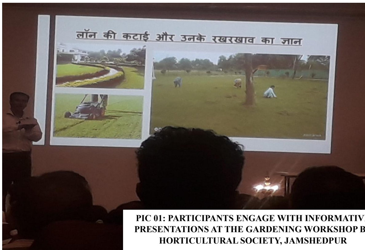
PIC 01: PARTICIPANTS ENGAGE WITH INFORMATIVE PRESENTATIONS AT THE GARDENING WORKSHOP BY HORTICULTURAL SOCIETY, JAMSHEDPUR