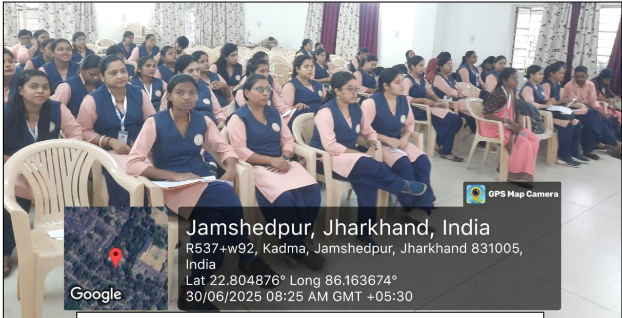
PIC 3: B.ED. PUPIL TEACHERS ATTENDING THE EVENT

E-mail : dbms.edu23@gmail.com | Website : dbmscollege.in