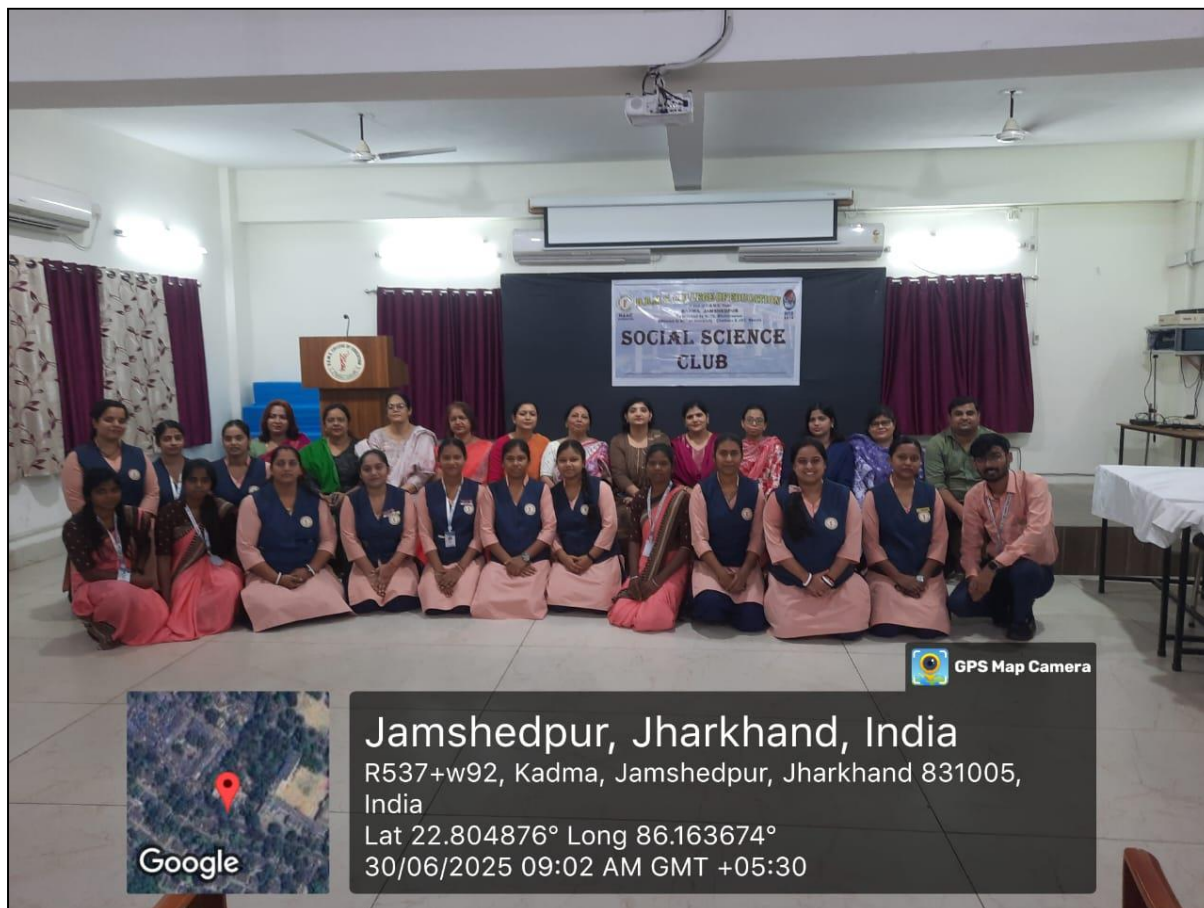
PIC 7- GROUP PHOTOGRAPHS WITH THE STUDENTS AND FACULTY MEMBERS

E-mail : dbms.edu23@gmail.com | Website : dbmscollege.in