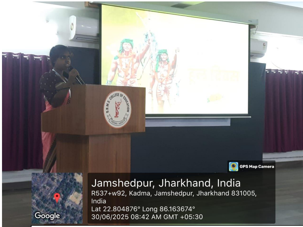
PIC 5: STUDENT EXPRESSING HER THOUGHTS ON HUL DIWAS

E-mail : dbms.edu23@gmail.com | Website : dbmscollege.in