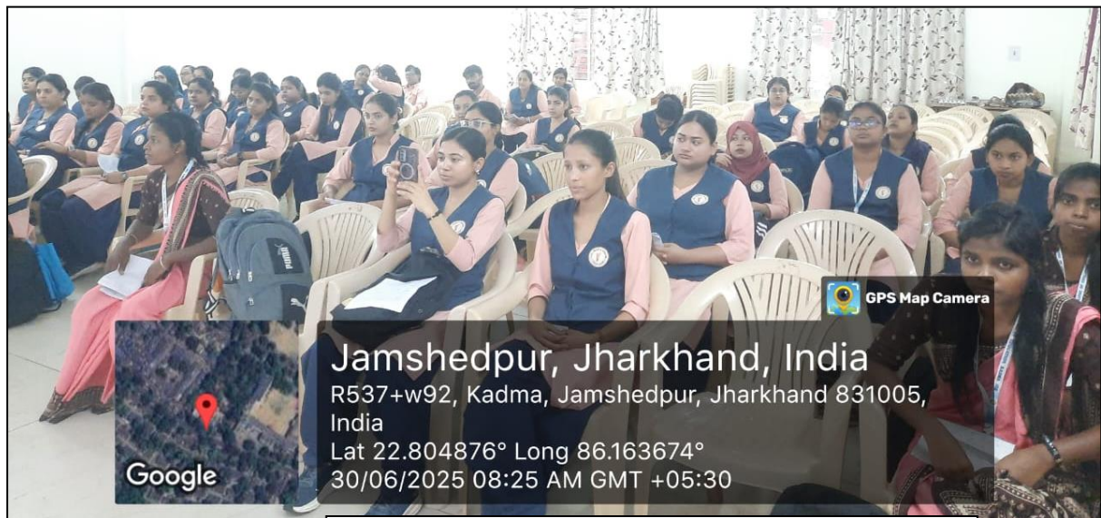
PIC 2 - AUDIENCE FOR THE EVENT