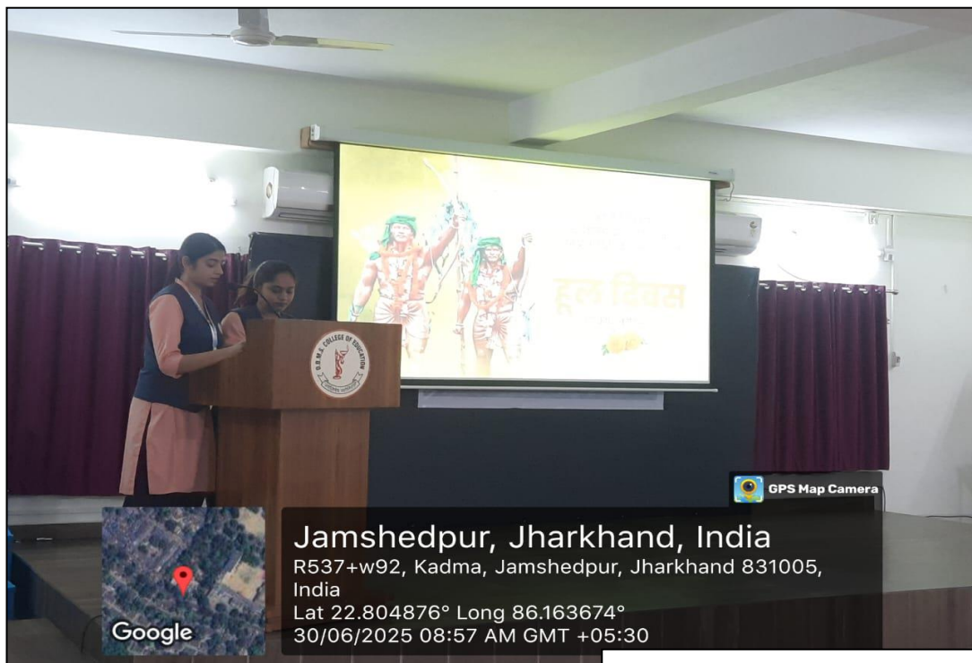
PIC 6: ANCHORS OF THE EVENT