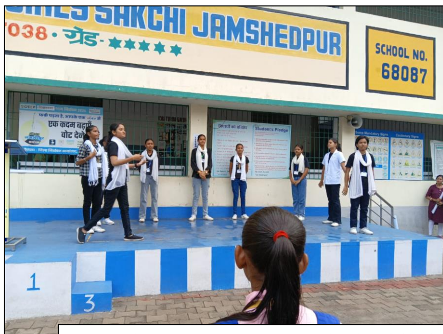
PIC 2-NUKKAD NATAK IN, CM SCHOOL OF EXCELLENCE GIRLS SAKCHI JAMSHEDPUR