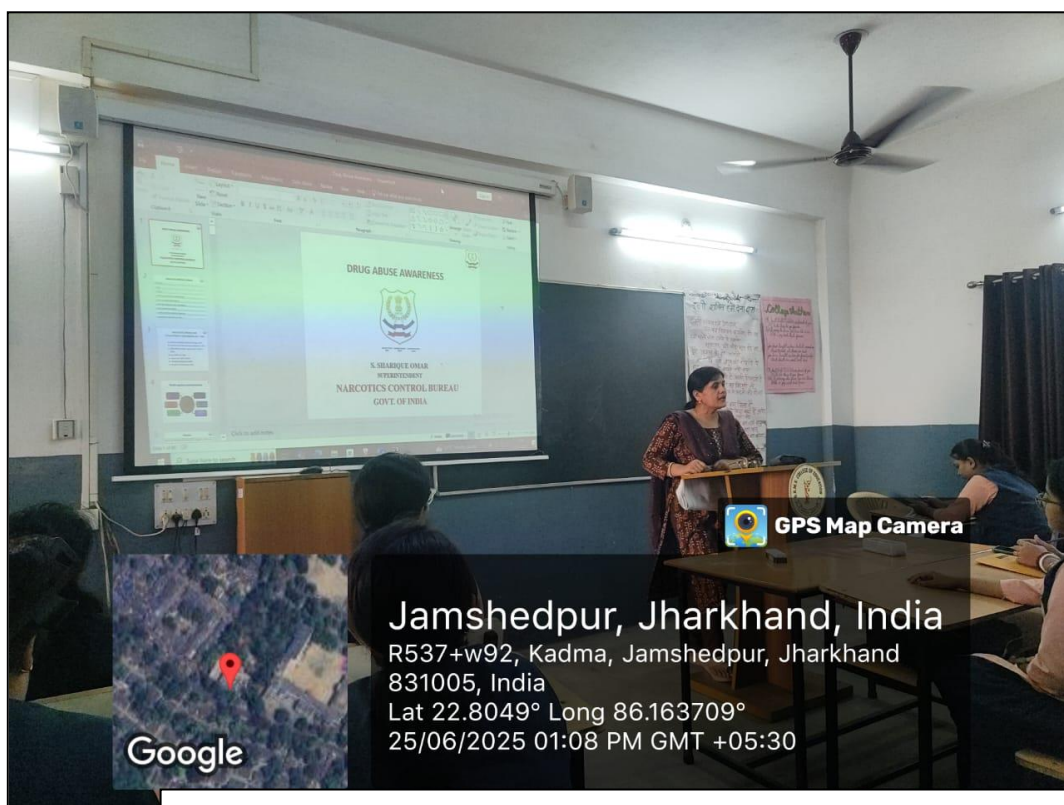
PIC 6- CLASS ROOM SEMINAR REGARDING NASHA MUKT ABHIYAAN 2025