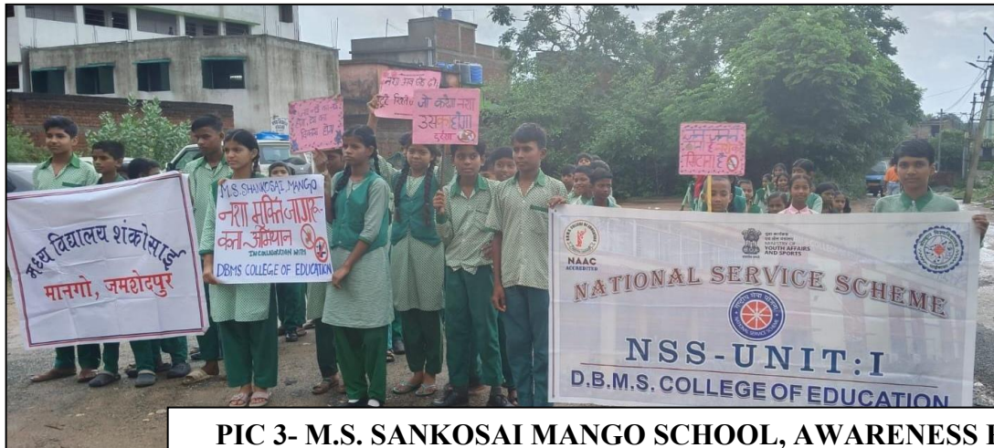
PIC 3- M.S. SANKOSAI MANGO SCHOOL, AWARENESS RAILLY

E-mail : dbms.edu23@gmail.com | Website : dbmscollege.in