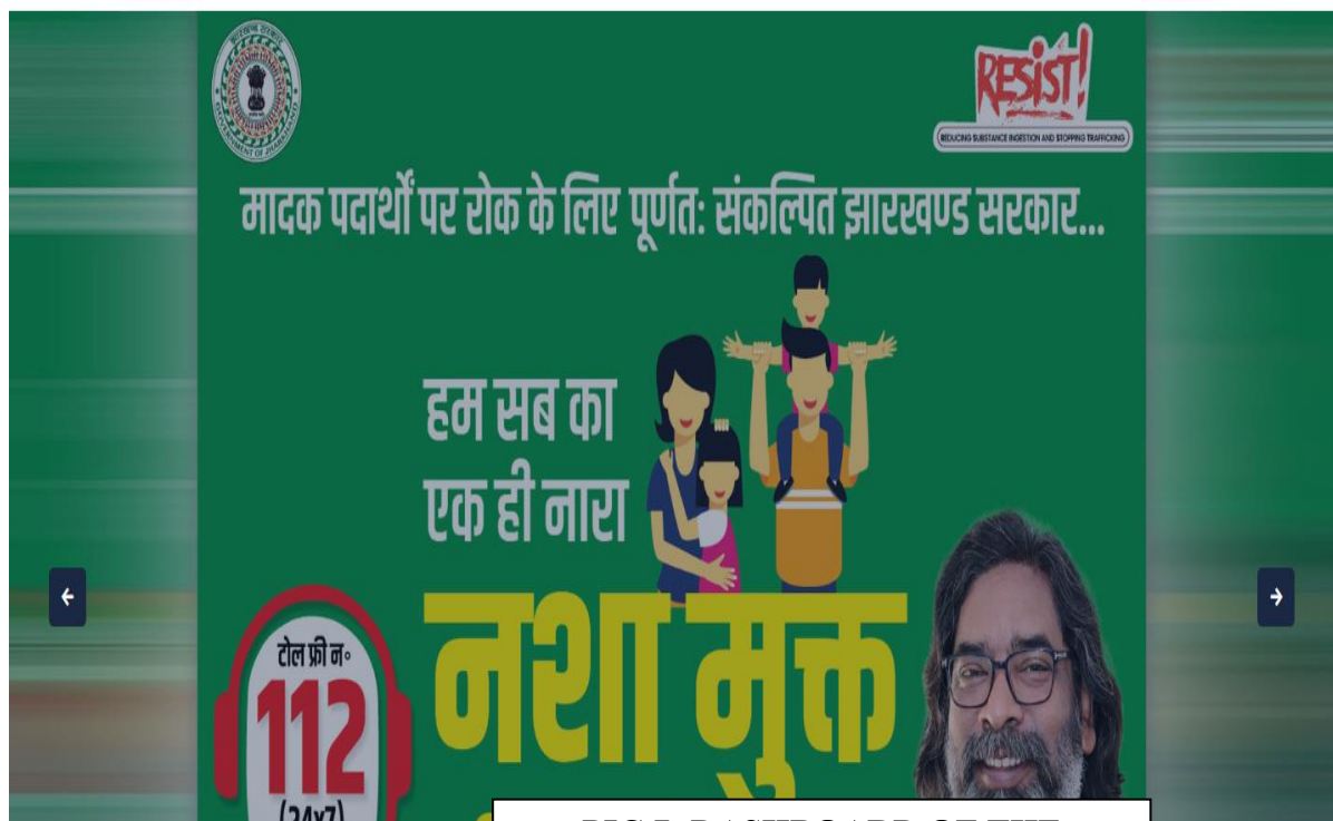
PIC 7- DASHBOARD OF THE PORTAL