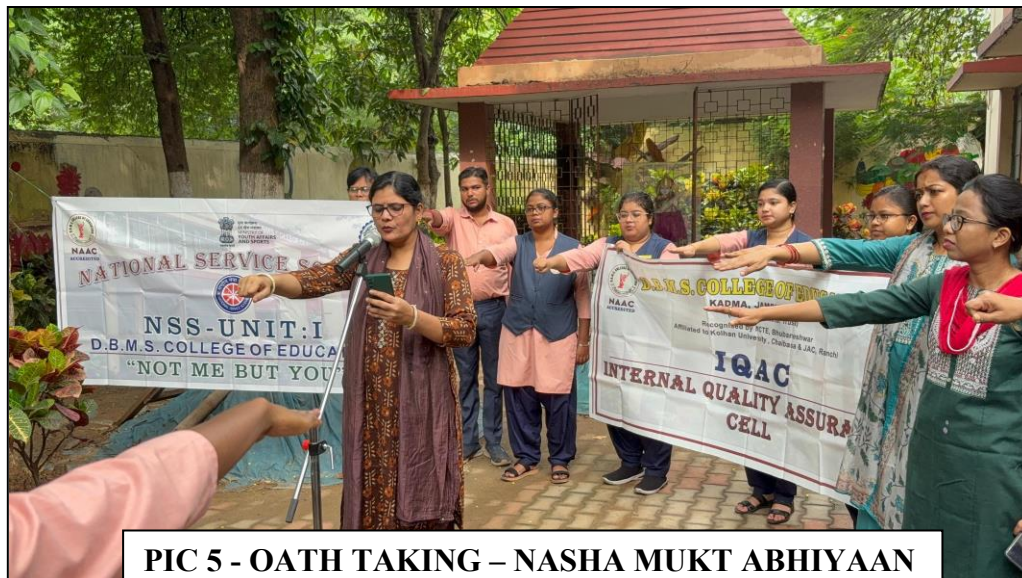
PIC 5 - OATH TAKING – NASHA MUKT ABHIYAAN

E-mail : dbms.edu23@gmail.com | Website : dbmscollege.in