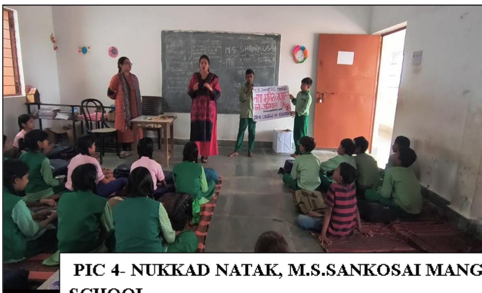
PIC 4- NUKKAD NATAK, M.S.SANKOSAI MANGO SCHOOL