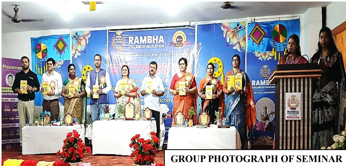
GROUP PHOTOGRAPH OF SEMINAR