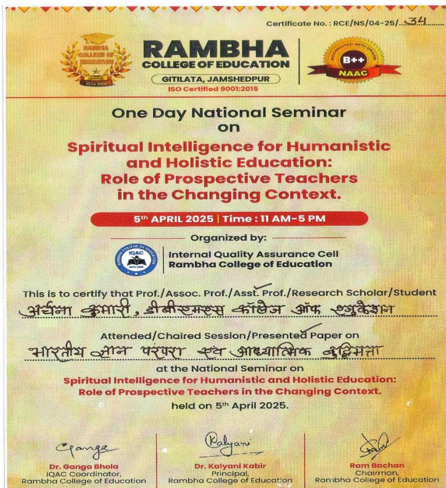
CERTIFICATE OF ONE DAY NATIONAL SEMINAR