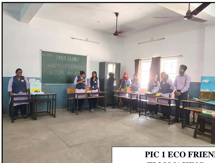
PIC 1 ECO FRIENDLY TLM MAKING