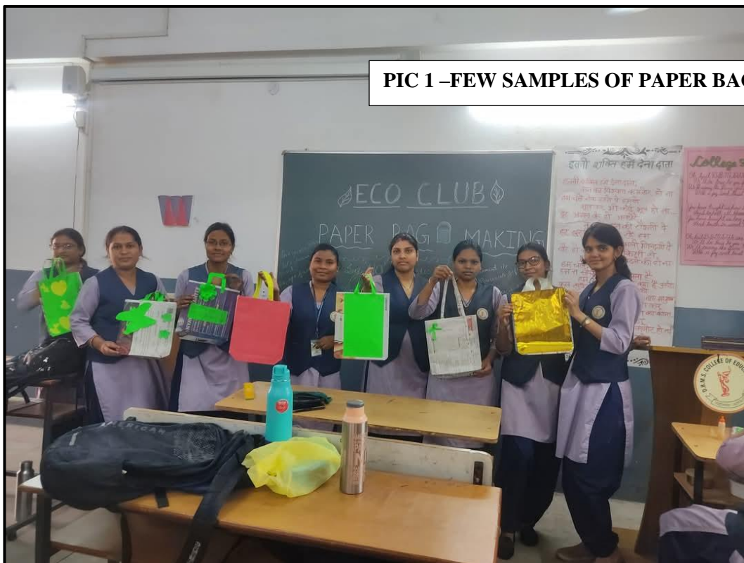
PIC 1 –FEW SAMPLES OF PAPER BAGS