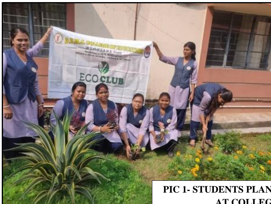
PIC 1- STUDENTS PLANTING TREES AT COLLEGE