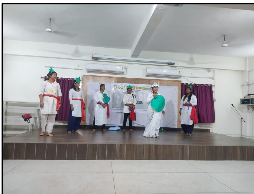
PIC 2 NUKKAD NATAK PERFORMED BY STUDENTS