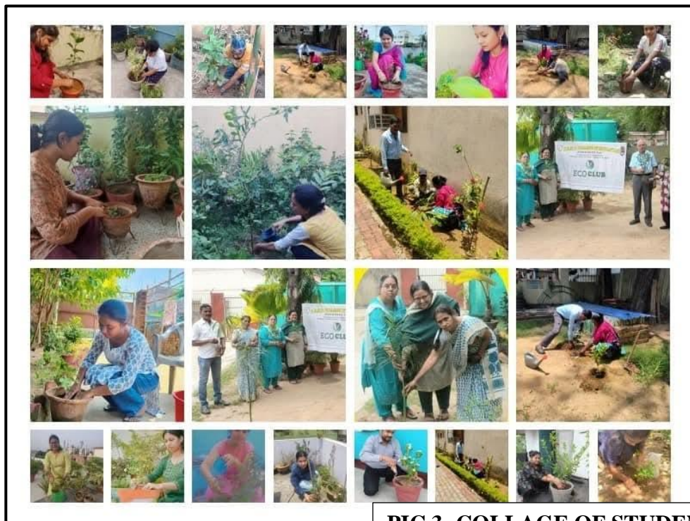
PIC 3- COLLAGE OF STUDENTS PLANTING TREES AT HOME

E-mail : dbms.edu23@gmail.com | Website : dbmscollege.in