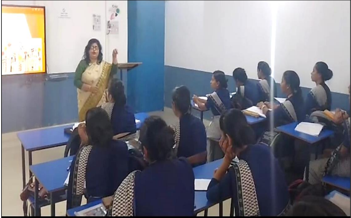
PIC 03: GROUP DISCUSSION

(Recognised by National Council for Teacher Education) Affiliated to Kolhan University, Chaibasa & J. A. C., Ranchi, Jharkhand Road No. 23, Farm Area, Kadma, Jamshedpur-831005 | Phone : 2309097 E-mail : dbms.edu23@gmail.com | Website : dbmscollege.in