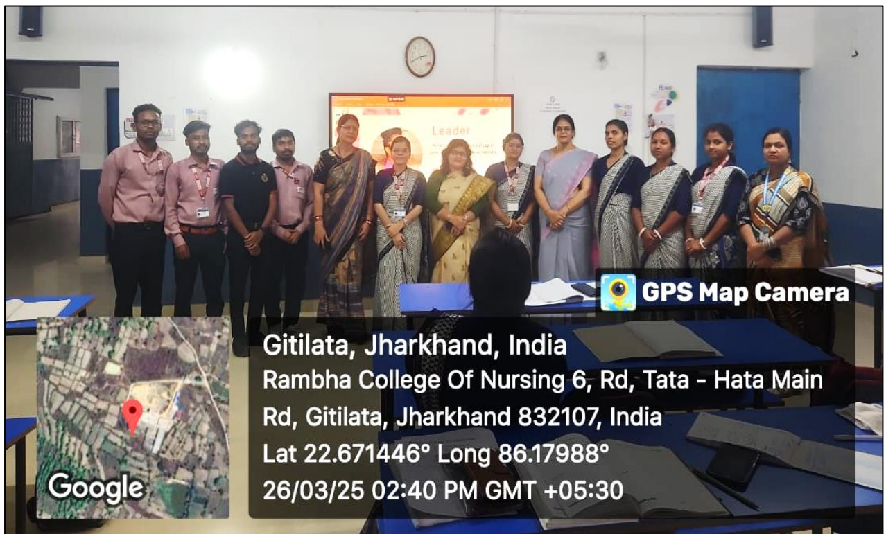
PIC 04: GROUP PHOTO WITH THE PATICIPANTS