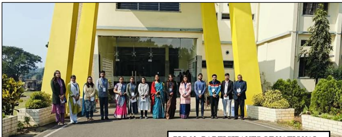
PIC 02: PARTICIPANTS OF NATIONAL CONFERENCE