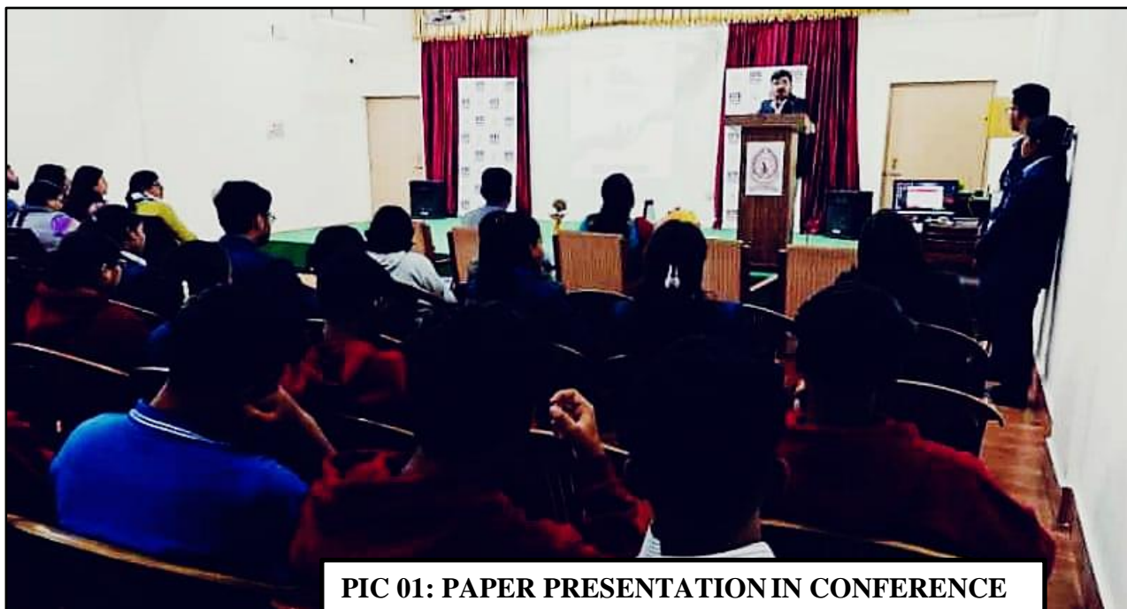
PIC 01: PAPER PRESENTATION IN CONFERENCE