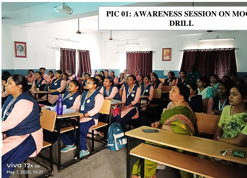
PIC 01: AWARENESS SESSION ON MOCK DRILL