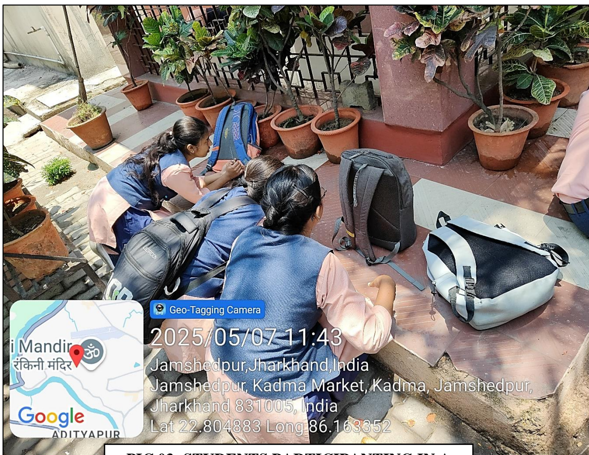
PIC 03: STUDENTS PARTICIPATING IN A MOCK DRILL

E-mail : dbms.edu23@gmail.com | Website : dbmscollege.in