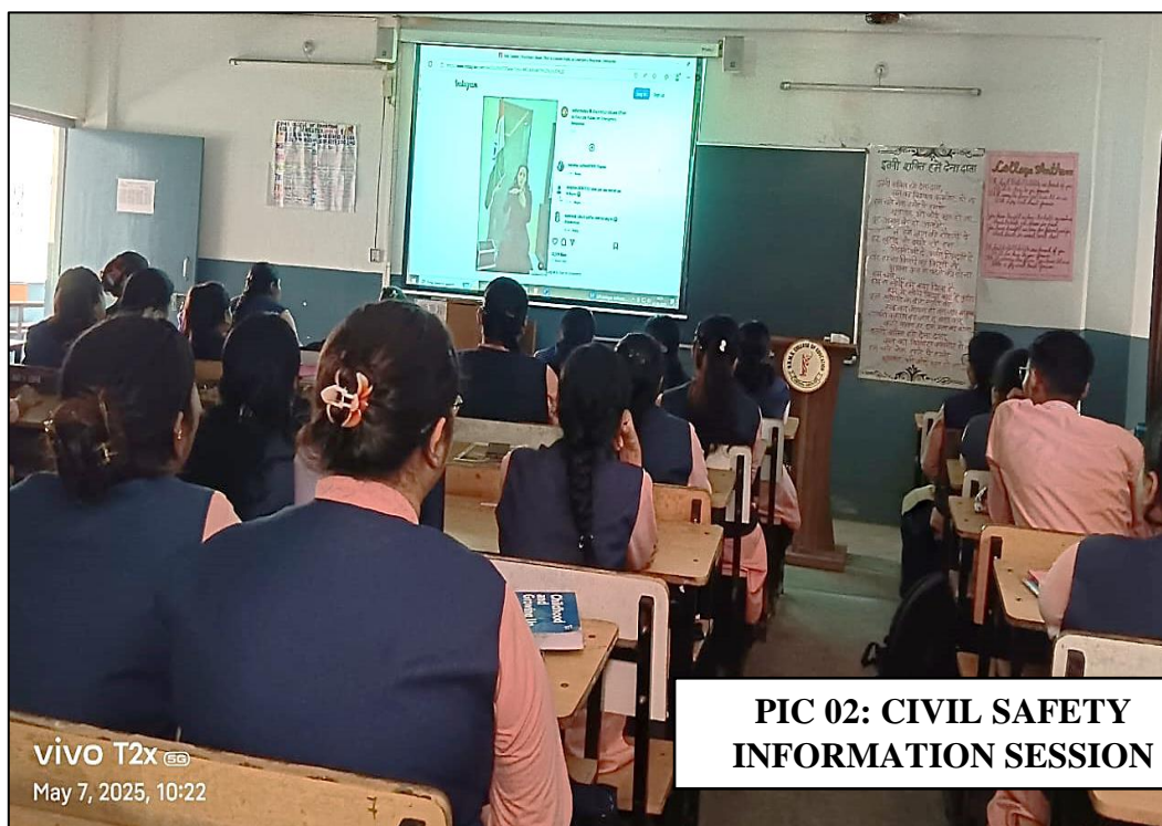
PIC 02: CIVIL SAFETY INFORMATION SESSION