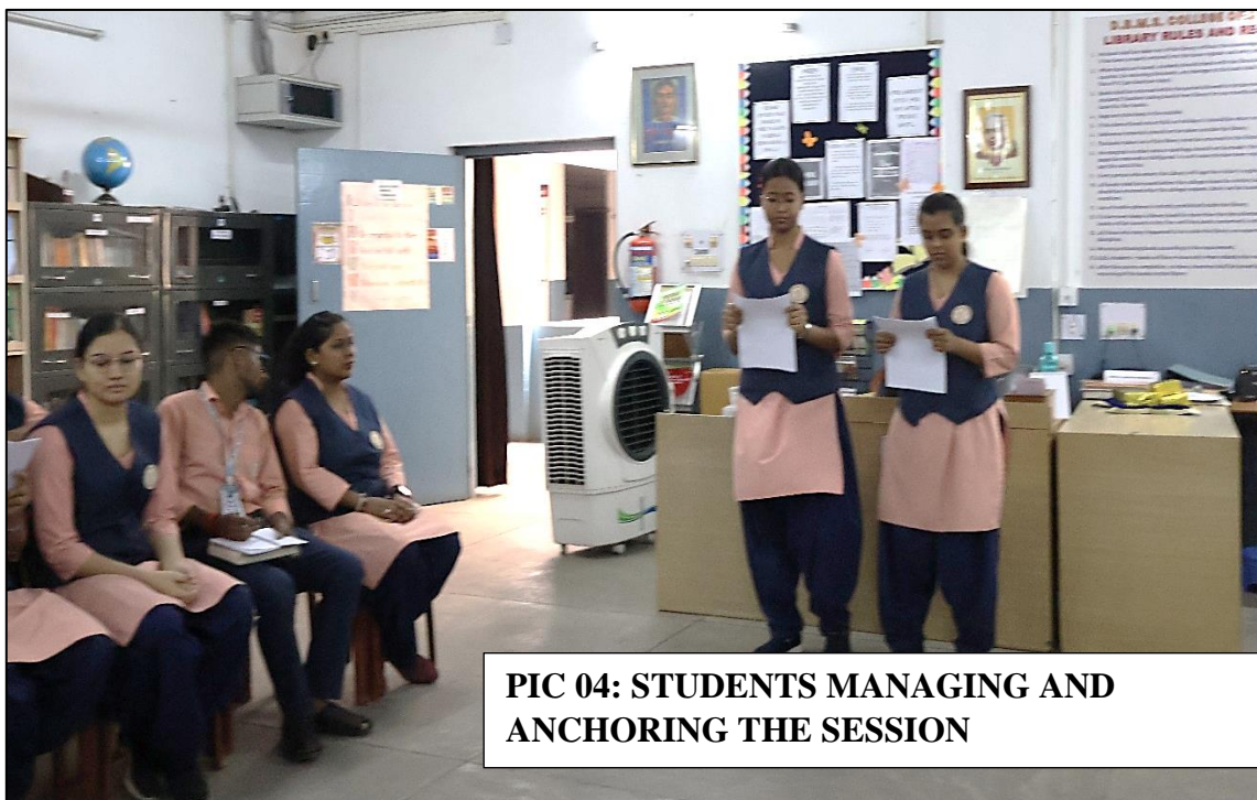
PIC 04: STUDENTS MANAGING AND ANCHORING THE SESSION