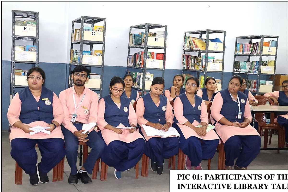
PIC 01: PARTICIPANTS OF THE INTERACTIVE LIBRARY TALK