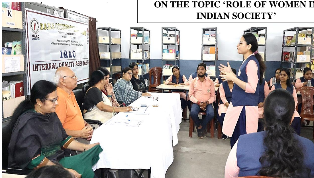
PIC 03: PARTICIPANTS SHARING VIEWS ON THE TOPIC 'ROLE OF WOMEN IN INDIAN SOCIETY'

E-mail : dbms.edu23@gmail.com | Website : dbmscollege.in