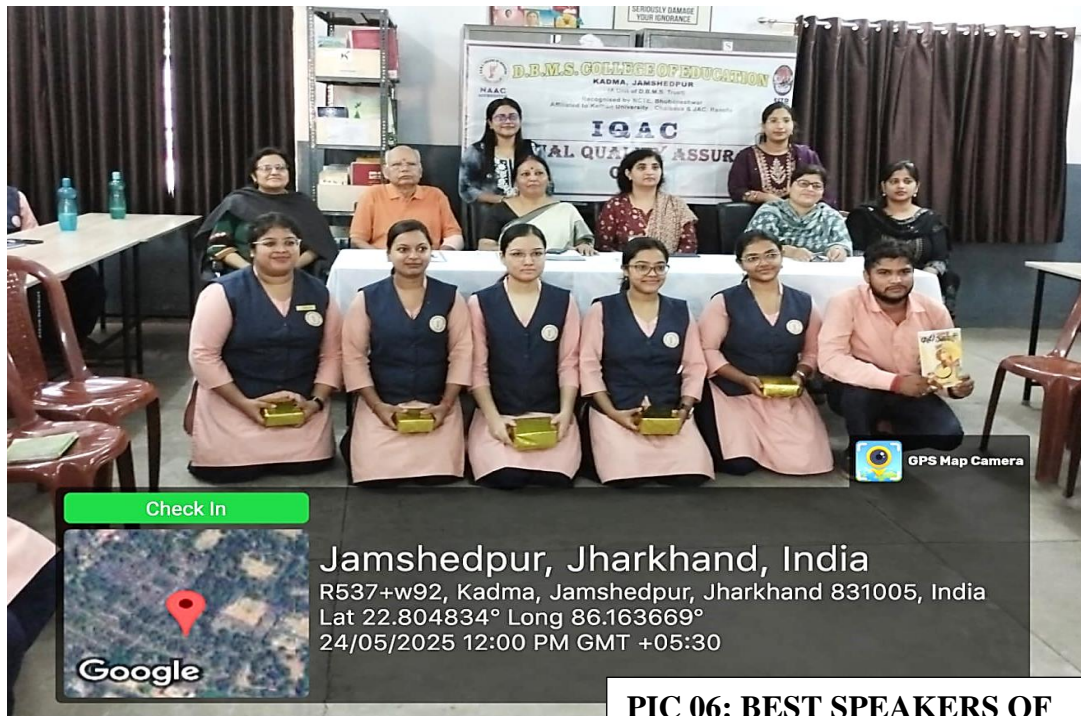
PIC 06: BEST SPEAKERS OF TODAY'S INTERACTIVE TALK