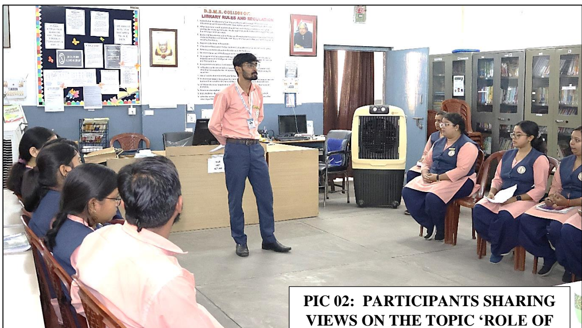
PIC 02: PARTICIPANTS SHARING VIEWS ON THE TOPIC 'ROLE OF WOMEN IN INDIAN SOCIETY'