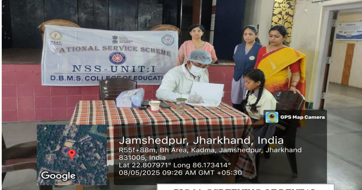
PIC 04: SCREENING OF DENTAL CHECK UP

E-mail : dbms.edu23@gmail.com | Website : dbmscollege.in