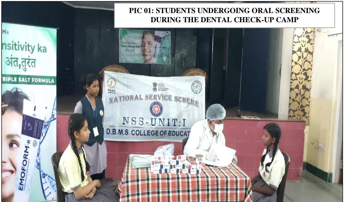
PIC 01: STUDENTS UNDERGOING ORAL SCREENING DURING THE DENTAL CHECK-UP CAMP