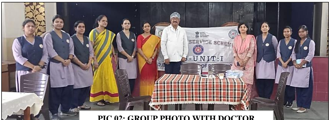
PIC 02: GROUP PHOTO WITH DOCTOR