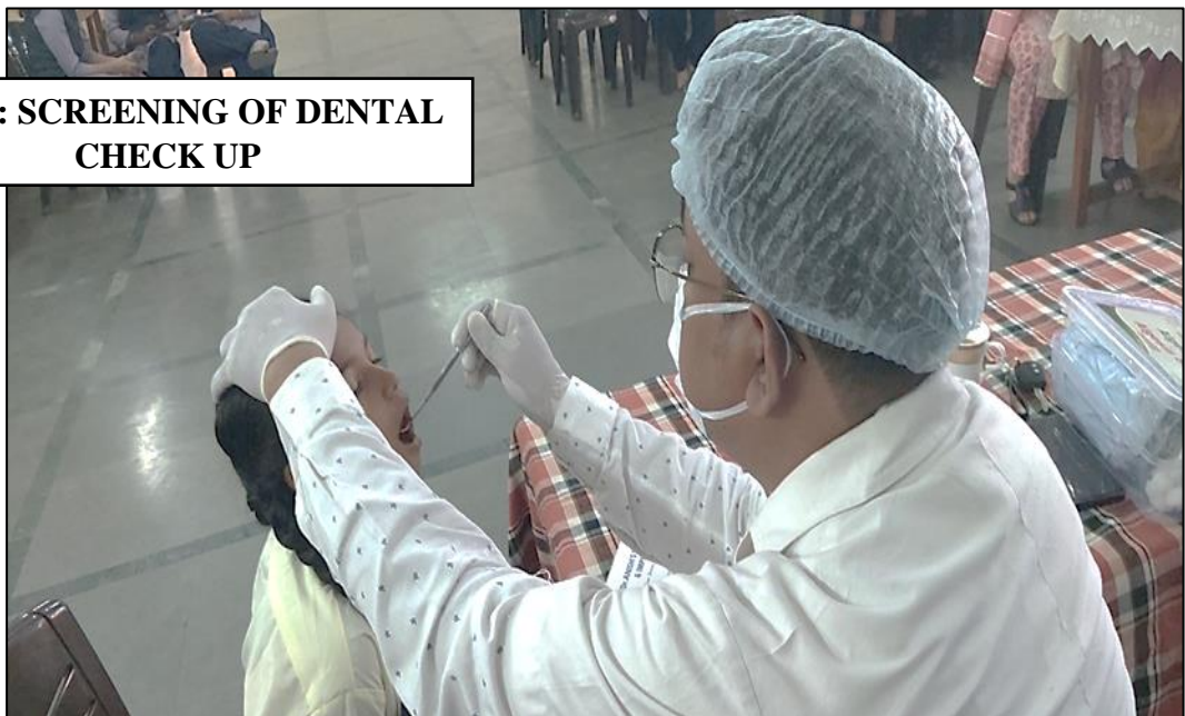
PIC 03: SCREENING OF DENTAL CHECK UP