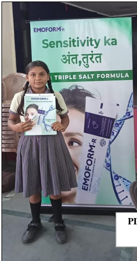
PIC 03: STUDENT RECEIVING FREE ORAL KITS

E-mail : dbms.edu23@gmail.com | Website : dbmscollege.in