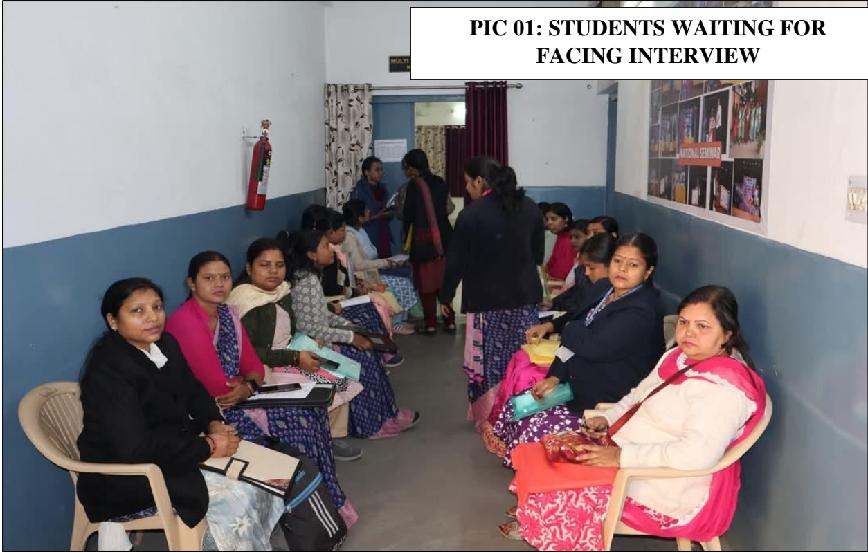
PIC 01: STUDENTS WAITING FOR FACING INTERVIEW