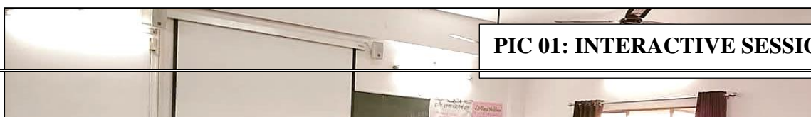
PIC 01: INTERACTIVE SESSION