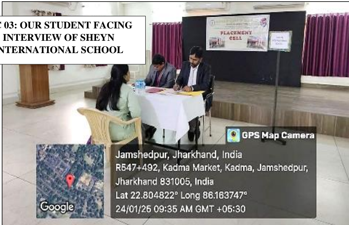
PIC 03: OUR STUDENT FACING INTERVIEW OF SHEYN INTERNATIONAL SCHOOL

(Recognised by National Council for Teacher Education) Affiliated to Kolhan University, Chaibasa & J. A. C., Ranchi, Jharkhand Road No. 23, Farm Area, Kadma, Jamshedpur-831005 | Phone : 2309097 E-mail : dbms.edu23@gmail.com | Website : dbmscollege.in