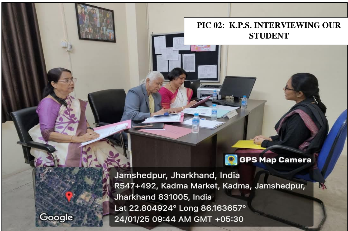
PIC 02: K.P.S. INTERVIEWING OUR STUDENT