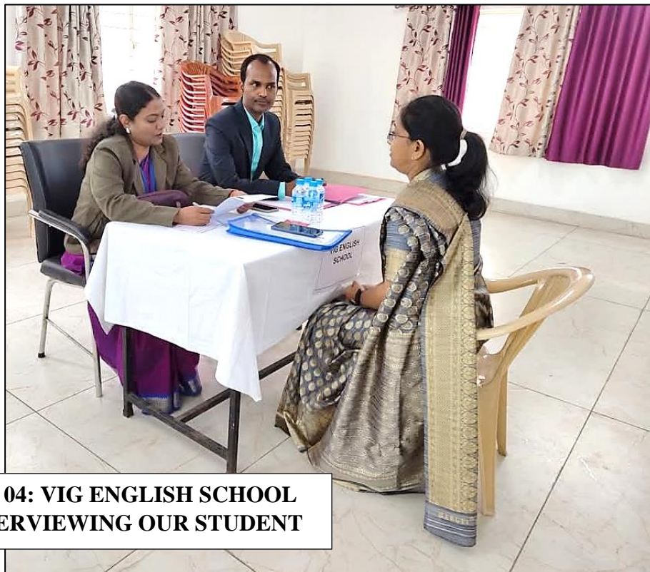
PIC 04: VIG ENGLISH SCHOOL INTERVIEWING OUR STUDENT