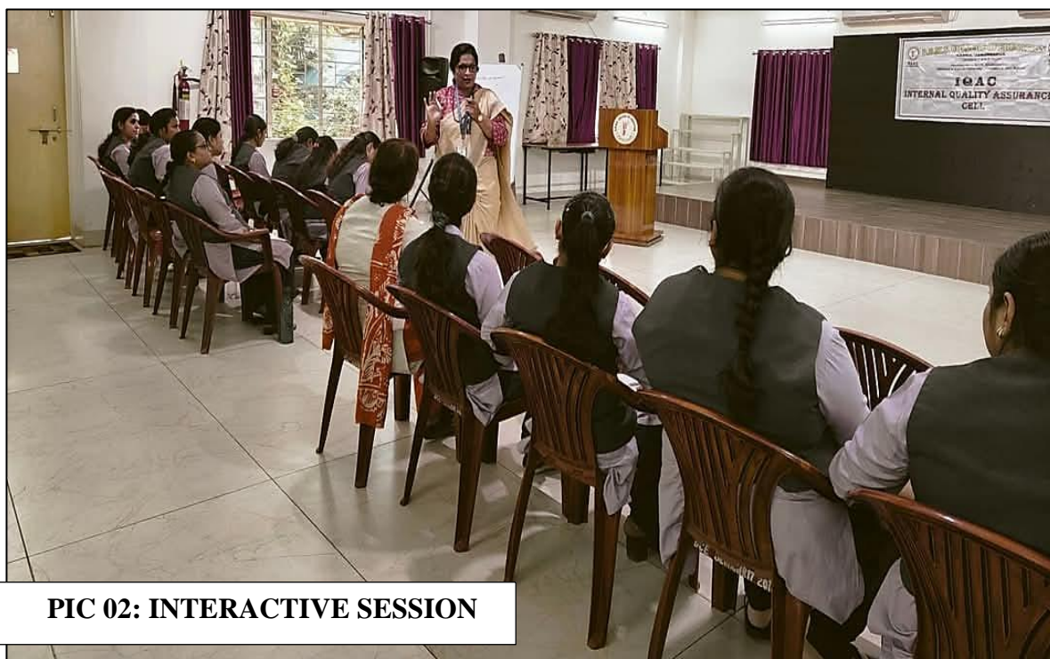
PIC 02: INTERACTIVE SESSION