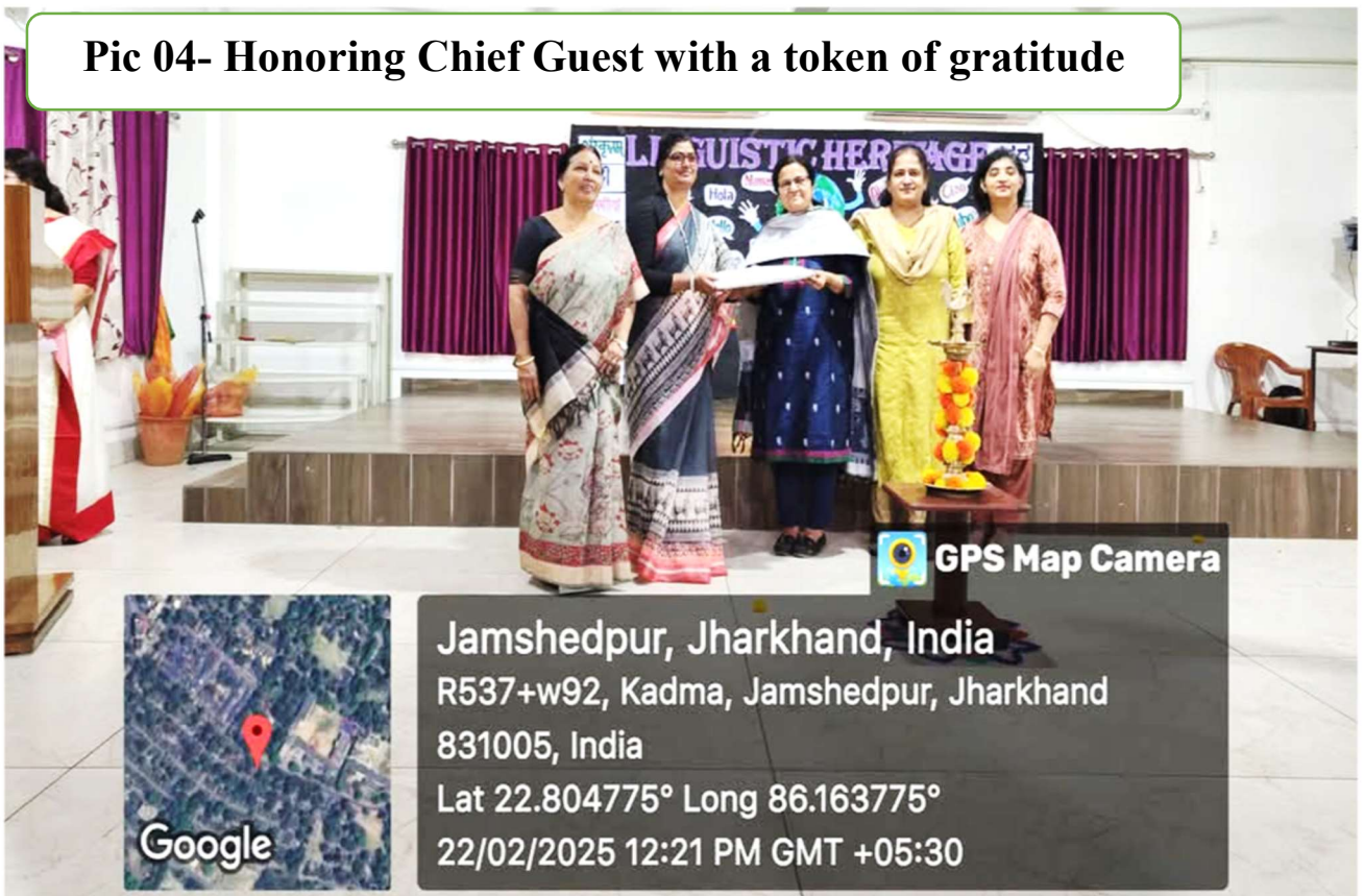
Pic 04- Honoring Chief Guest with a token of gratitude