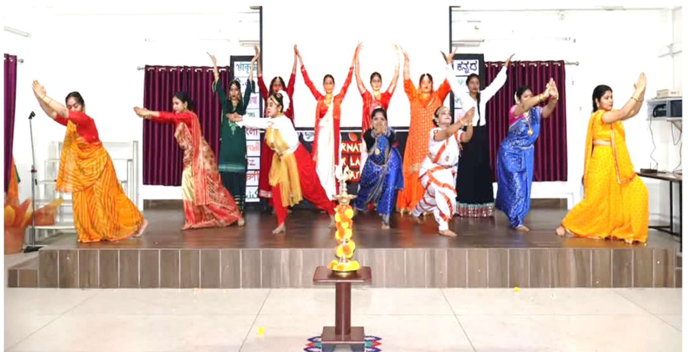
Pic 02- Cultural Performance on “भाषाओं के संग जीवन के तरंग”