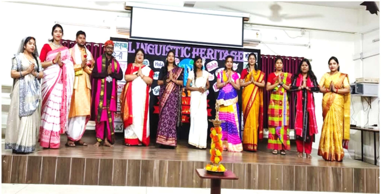
Pic 03- Exploring Cultural and Language Diversity

(Recognised by National Council for Teacher Education) Affiliated to Kolhan University, Chaibasa & J. A. C., Ranchi, Jharkhand Road No. 23, Farm Area, Kadma, Jamshedpur-831005 | Phone : 2309097 E-mail : dbms.edu23@gmail.com | Website : dbmscollege.in