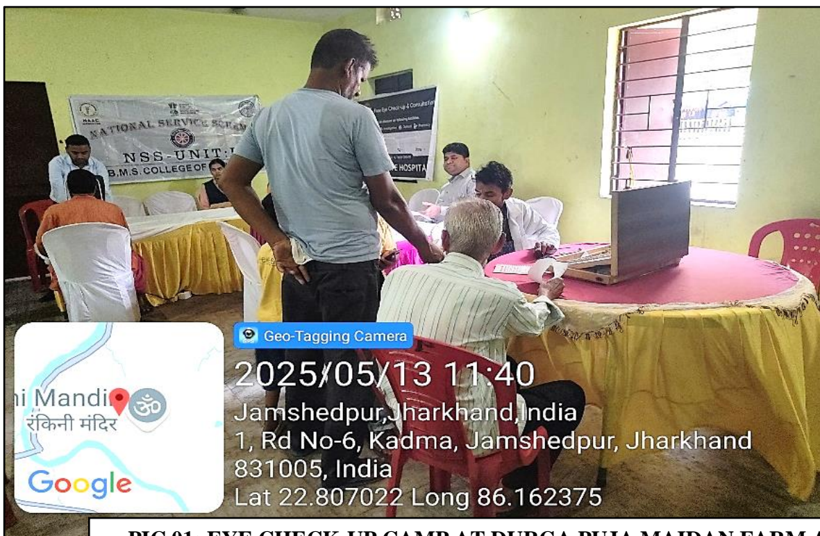
PIC 01: EYE CHECK-UP CAMP AT DURGA PUJA MAIDAN FARM AREA