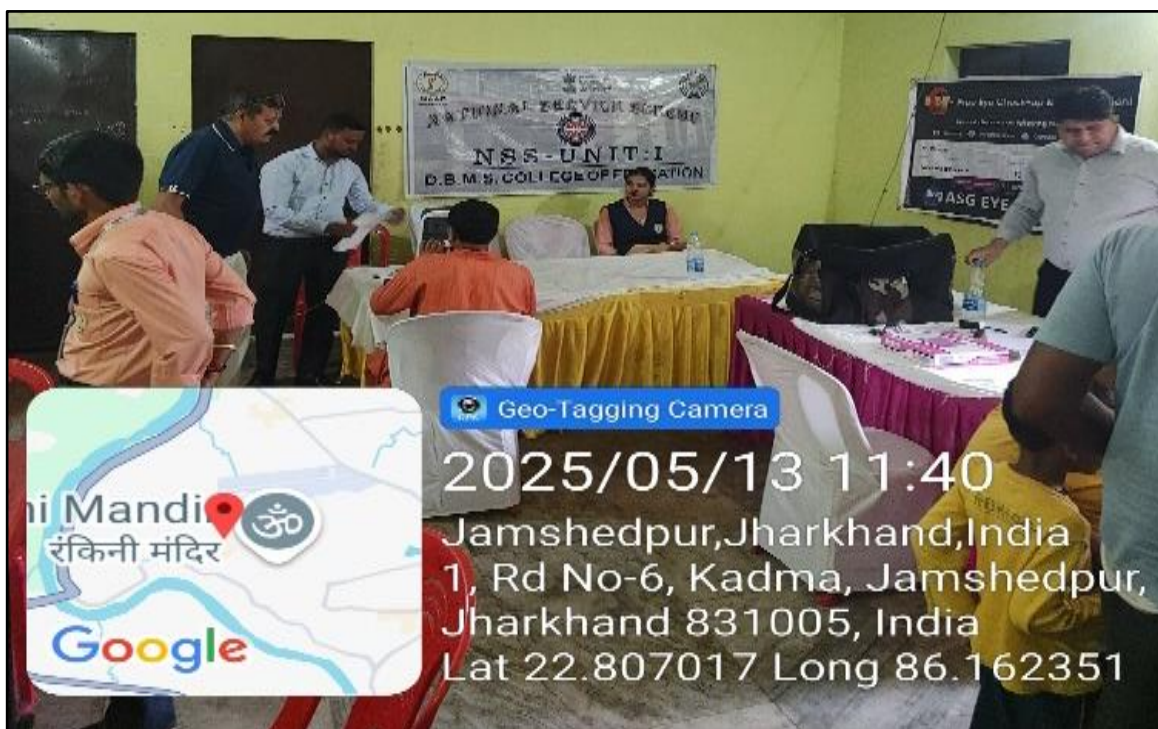
PIC 02: EYE CHECK-UP CAMP AT DURGA PUJA MAIDAN FARM AREA