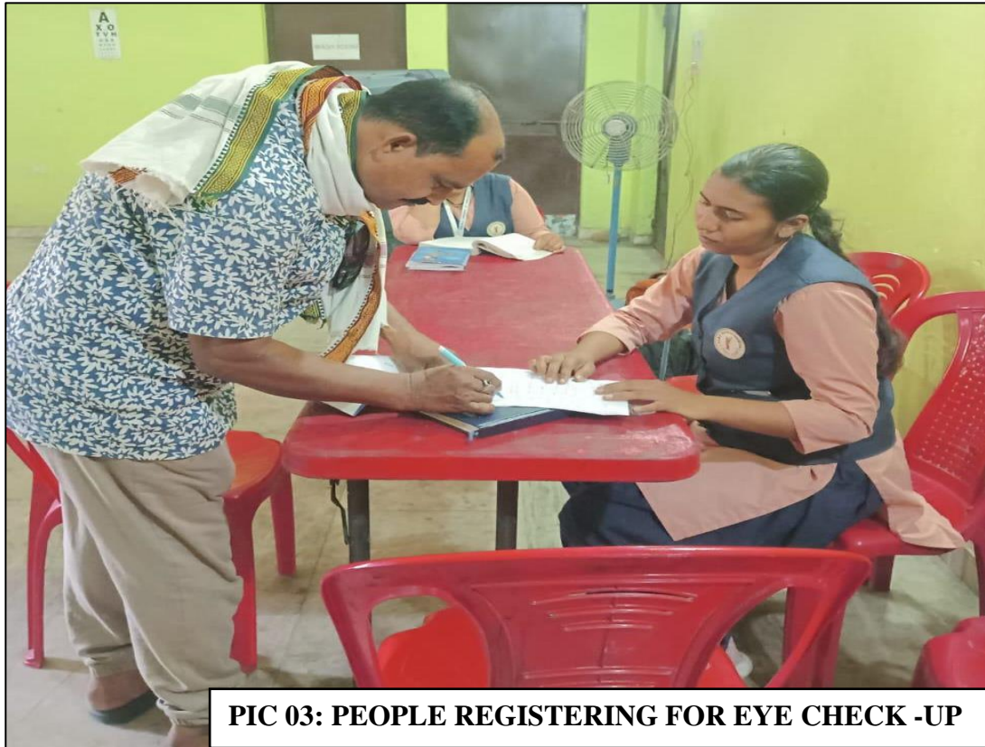
PIC 03: PEOPLE REGISTERING FOR EYE CHECK -UP

E-mail : dbms.edu23@gmail.com | Website : dbmscollege.in