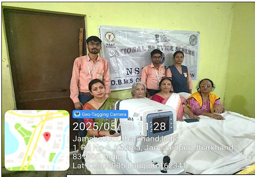
PIC 04: GROUP PHOTO WITH THE LIONS CLUB MEMBERS AND THE STUDENTS OF D.B.M.S. COLLEGE OF EDUCATION