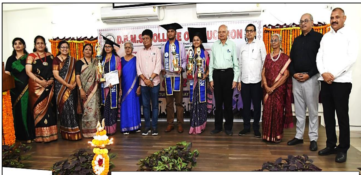
PIC 06: TOPPERS IN ACADEMIC PROFICIENCY WITH GUEST OF HONOUR AND MANAGEMENT MEMBERS