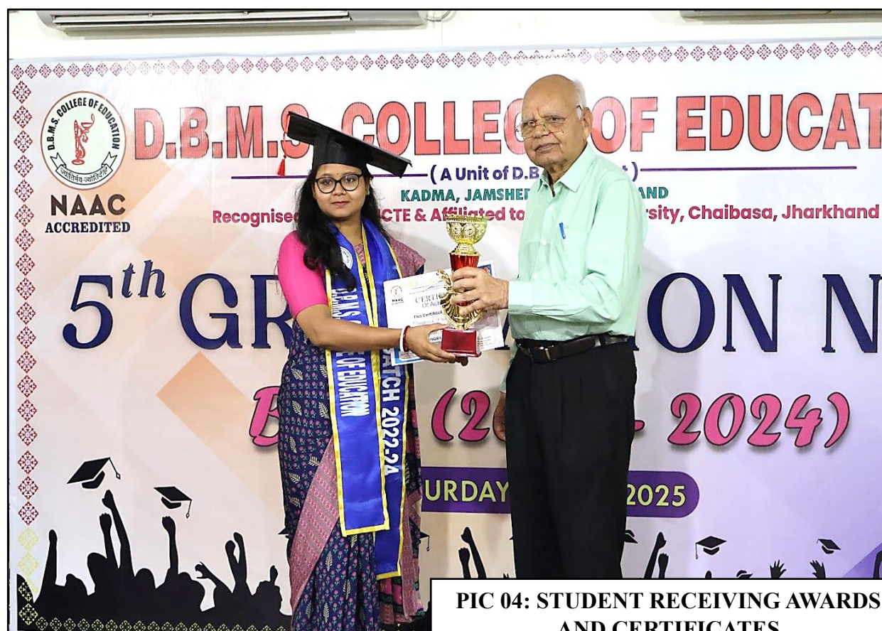
PIC 04: STUDENT RECEIVING AWARDS AND CERTIFICATES