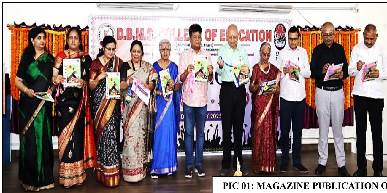
PIC 01: MAGAZINE PUBLICATION ON 5 th GRADUATION NITE