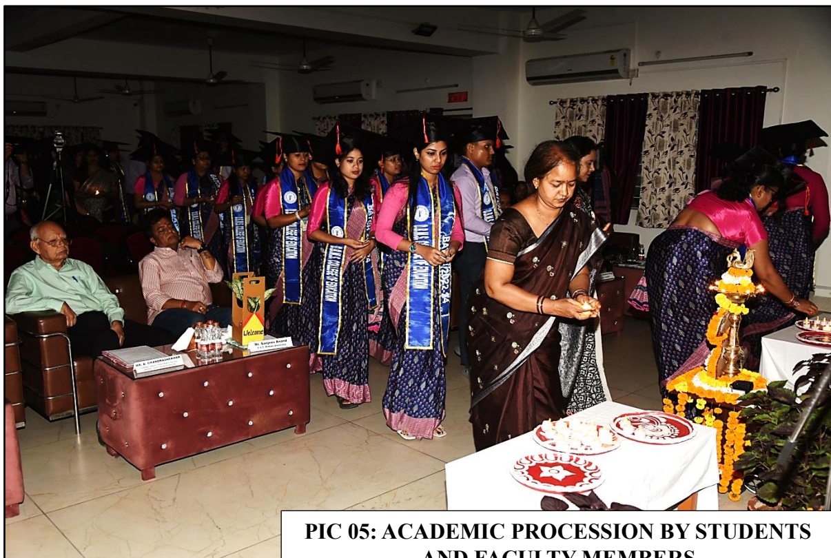
PIC 05: ACADEMIC PROCESSION BY STUDENTS AND FACULTY MEMBERS

E-mail : dbms.edu23@gmail.com | Website : dbmscollege.in