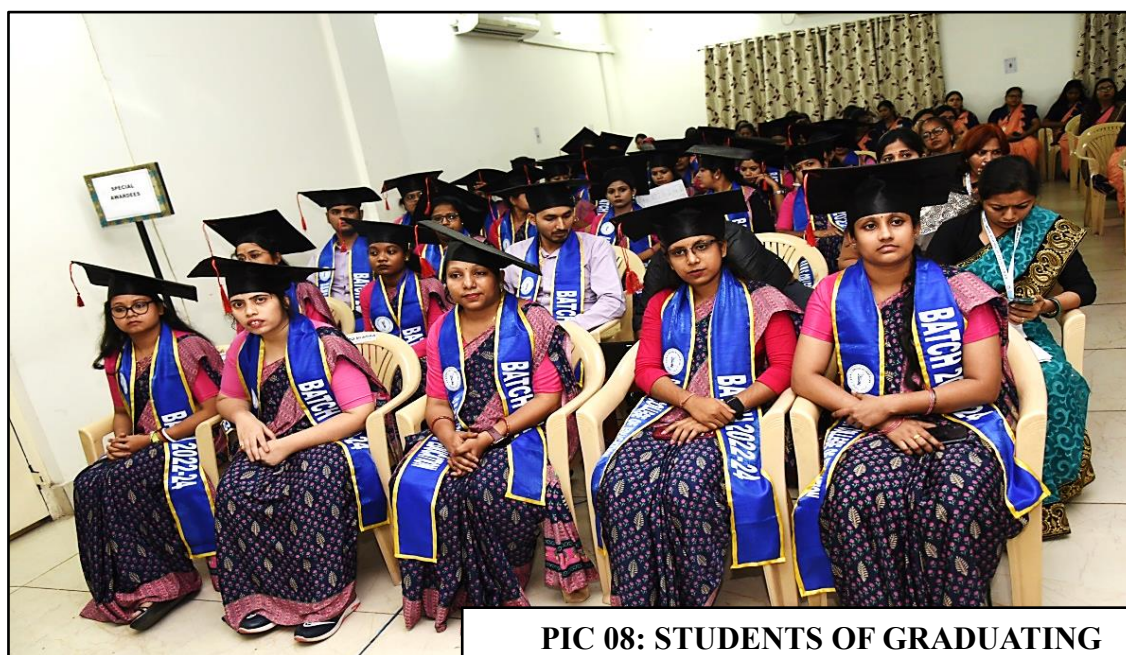
PIC 08: STUDENTS OF GRADUATING BATCH (2022-2024)