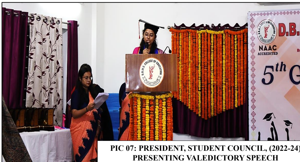
PIC 07: PRESIDENT, STUDENT COUNCIL, (2022-24) PRESENTING VALEDICTORY SPEECH

E-mail : dbms.edu23@gmail.com | Website : dbmscollege.in