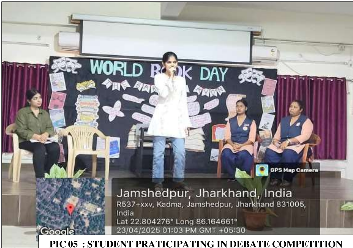
PIC 05 : STUDENT PRATICIPATING IN DEBATE COMPETITION