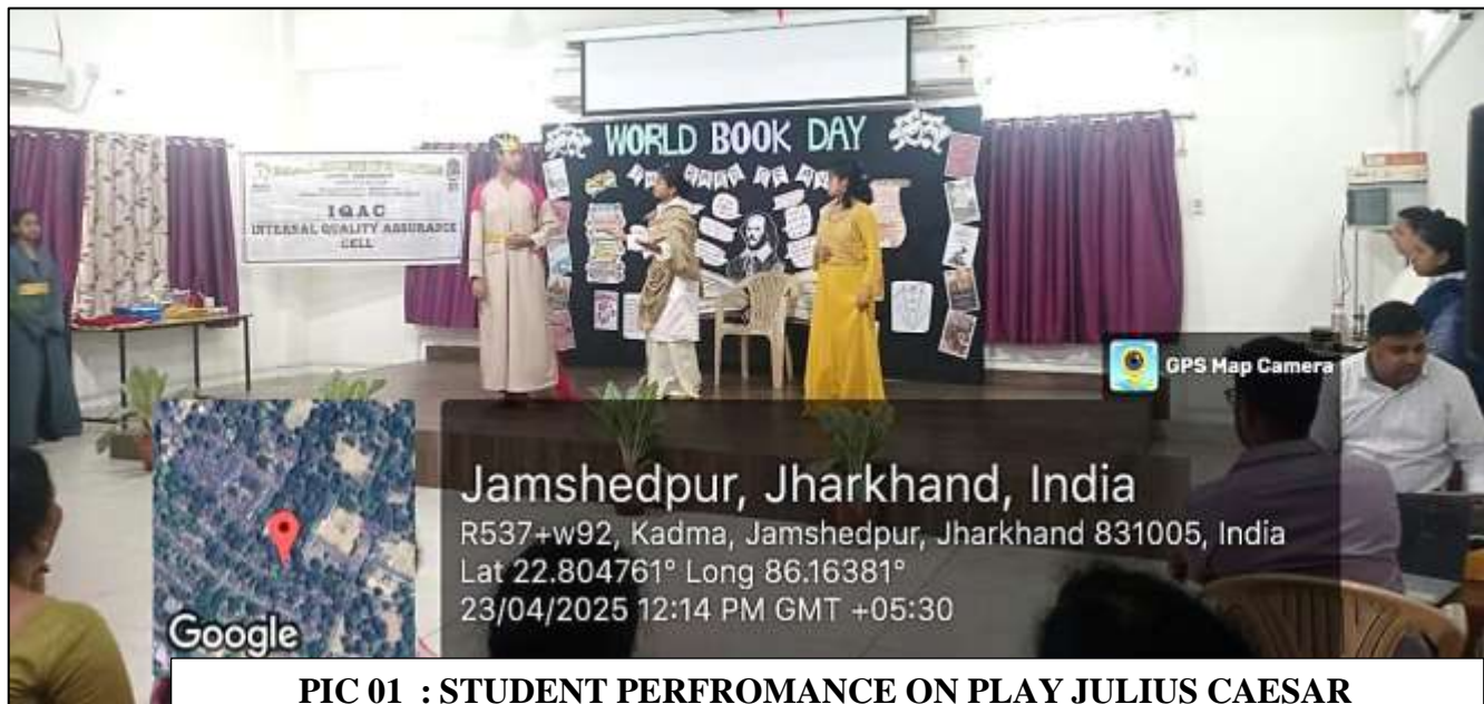
PIC 01 : STUDENT PERFORMANCE ON PLAY JULIUS CAESAR