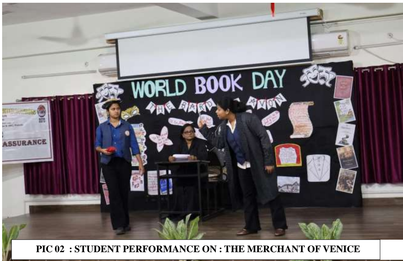
PIC 02 : STUDENT PERFORMANCE ON : THE MERCHANT OF VENICE