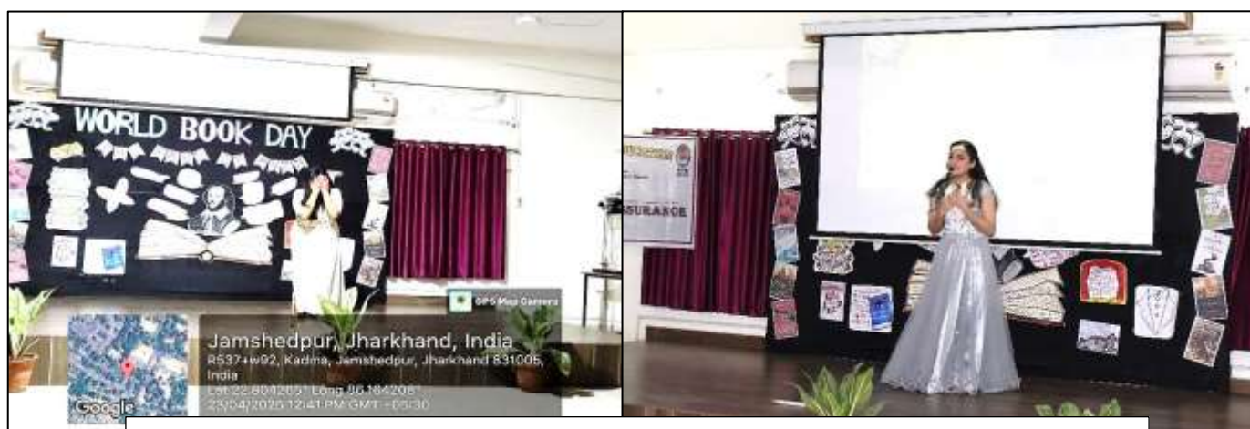
PIC 04 : ROLE PLAY & MONOLOGUE COMPETITION