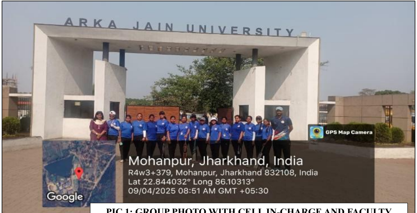
PIC 1: GROUP PHOTO WITH CELL IN-CHARGE AND FACULTY