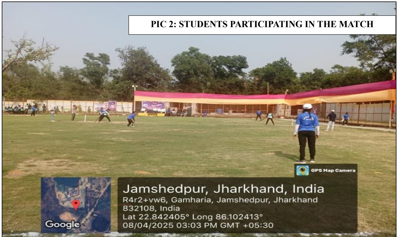
PIC 2: STUDENTS PARTICIPATING IN THE MATCH